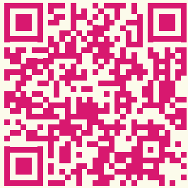
CAROLINAS CREDIT UNION LEAGUE