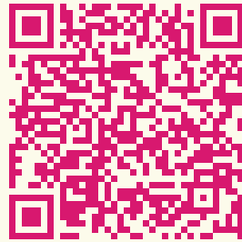
LEAGUE OF CREDIT UNIONS AND AFFILIATES