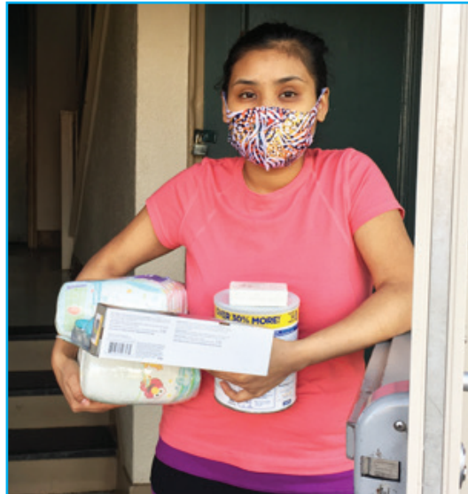
Home Visiting participant receives diapers and other baby supplies.

Often, our partnerships with nonprofits develop to address a recent challenge impacting our local community. In the face of the recent migrant crisis, Mary's Center has strengthened collaborations with several local nonprofits dedicated to supporting the migrant community, like SAMU First Response. SAMU and Mary's Center were able to grow our partnership by providing care for the migrants over the past year, with Mary's