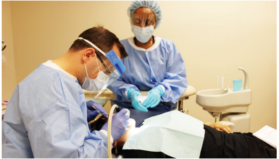
The addition of new dental chairs at the Petworth clinic will allow us to serve more participants at our busiest site.

By adding new dental chairs, Mary's Center expects to accommodate more than 300 additional appointments per month, resulting in 3,600 additional appointments per