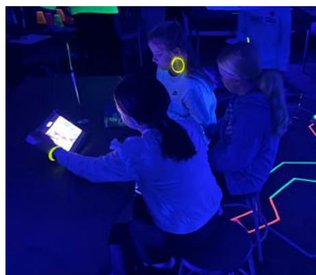
The FTMS Glow Day challenged students to complete activities as they learned about phosphorescent materials.