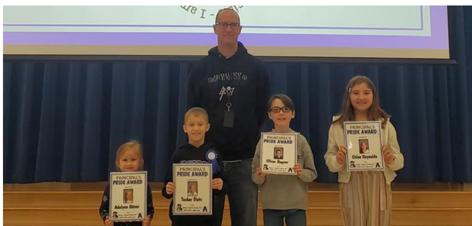
Whitehouse Primary recognized four students for going above and beyond the General Way expectations by honoring them with an assembly and a Principal's Pride Award.