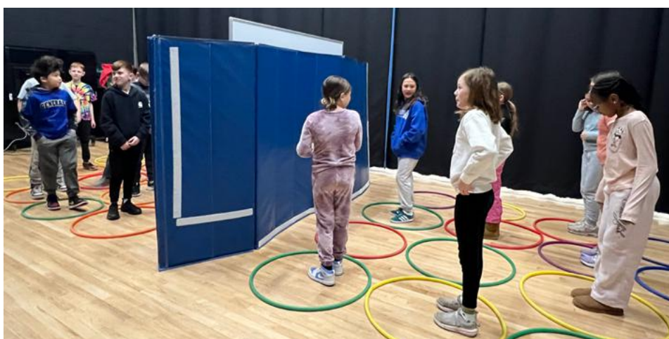
Monclova Primary students got a stretch break and mental challenge with a game of "Human Battleship." The first Wednesday of the month is designated as Wellness Wednesday across the District. Students and staff are encouraged to take time to focus on their health and wellness.