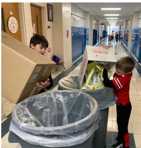
Waterville Primary first and fourth grade buddies work together to collect and process paper recycling for their school.