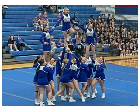
The AW Junior High cheer team took first place at the Springfield Invite and claimed third place at the Ohio Cheer State Championships.