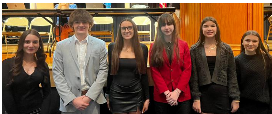
AHS students enrolled in American Government classes practiced their critical thinking and debate skills as they presented their ideas for new laws in the annual Model Congress event.