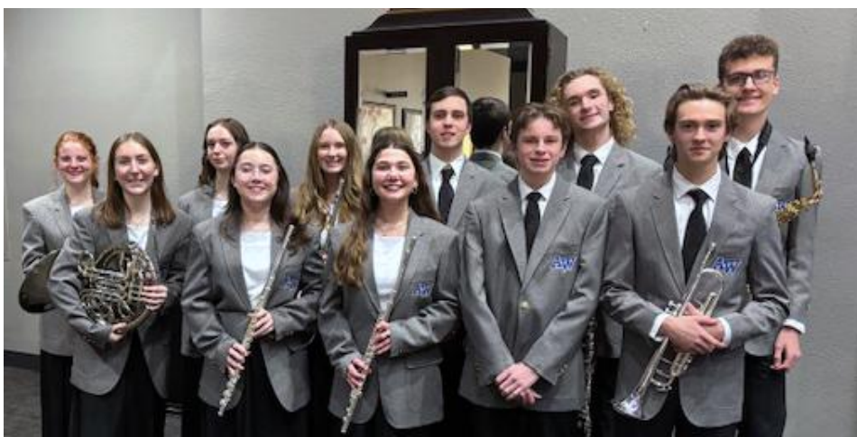
Eleven AWHs band members were selected by audition to participate in the OMEA District 1 Honors Festival. They performed with other top musicians from across the area at the Stranahan Theatre on January 19. Nine AWJH band members also participated in the festival. [READ MORE]