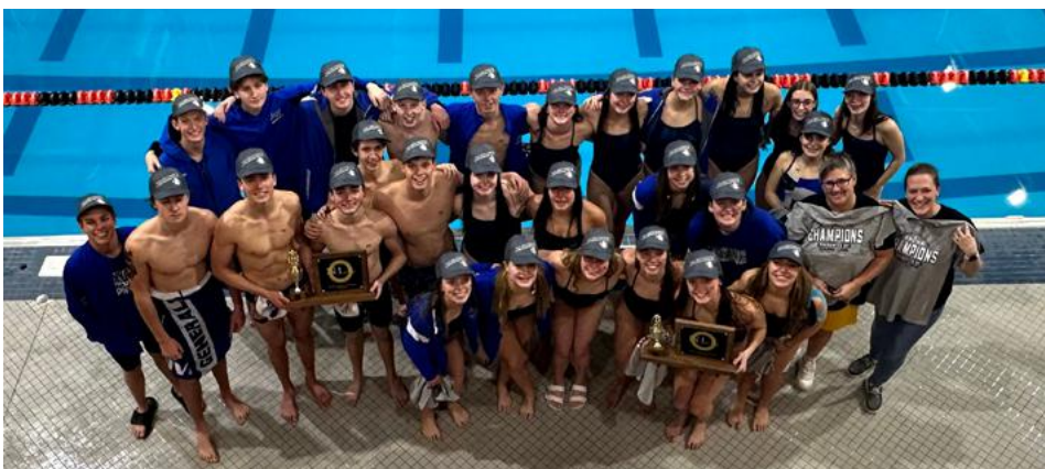
The AWHs boys and girls swim and dive teams were named NLL champs for the 2025 season.