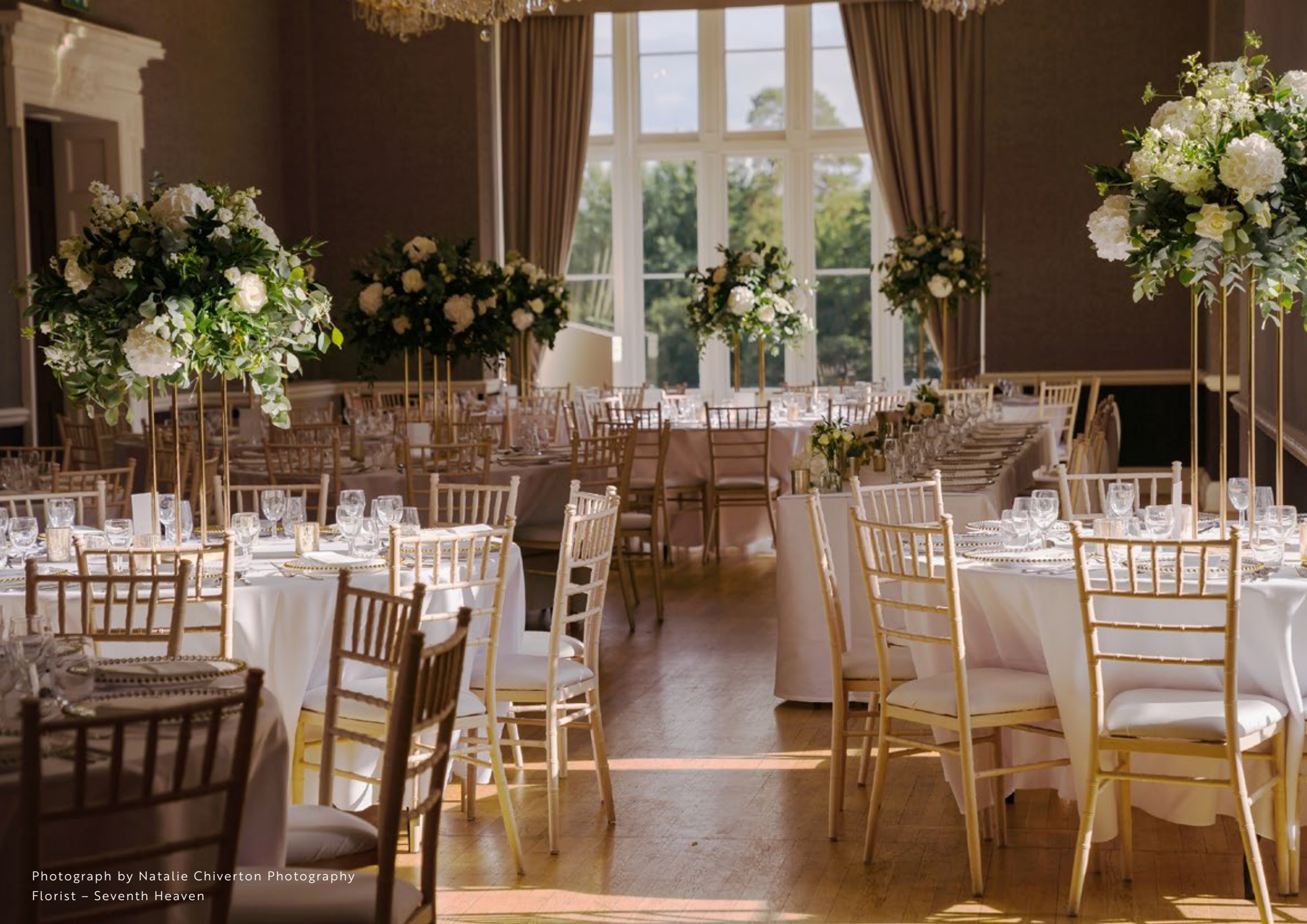
Photograph by Natalie Chiverton Photography Florist – Seventh Heaven