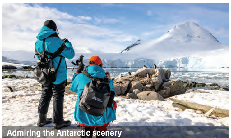
Admiring the Antarctic scenery