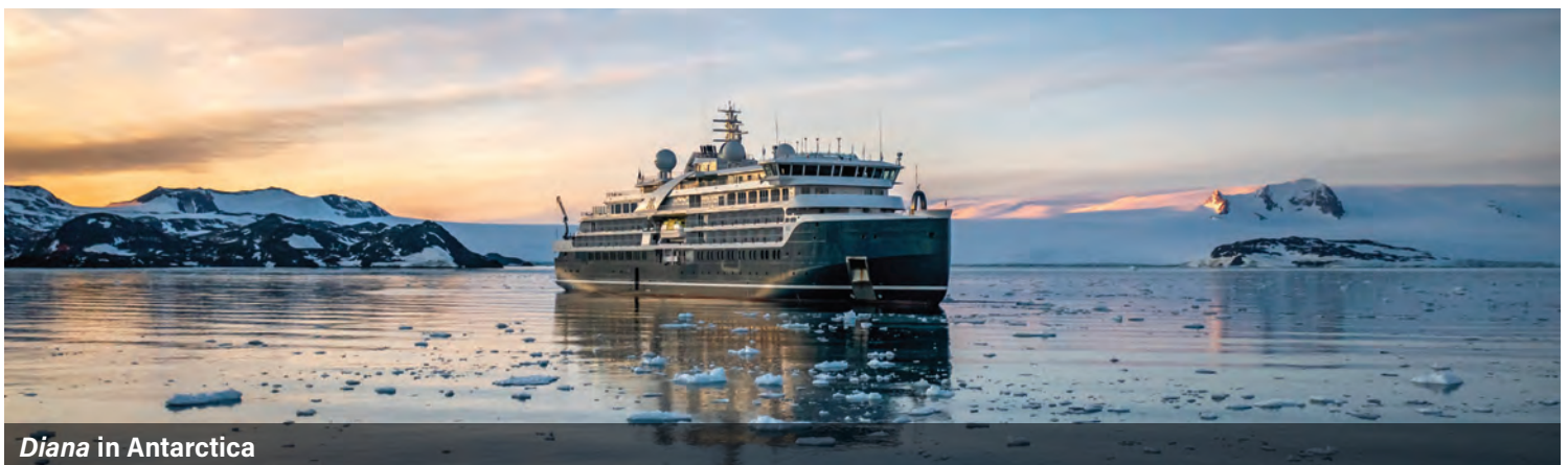
Diana in Antarctica

Transfer to the airport for the group flight to Ushuaia, claimed to be the world's southernmost city, located in Argentina's Tierra del Fuego, between the famed Beagle Channel and the mountains. On arrival, transfer to the pier to embark on the Diana , which will begin cruising early this evening. As the ship cruises the Beagle Channel, enjoy a spectacular vista of glaciers and misted mountains. (B, D)