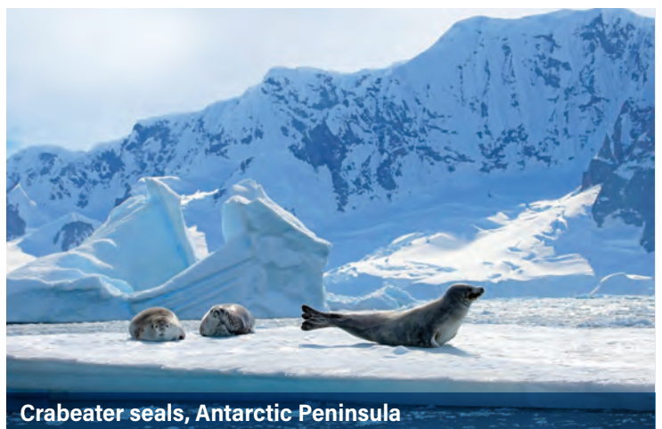
Crabeater seals, Antarctic Peninsula