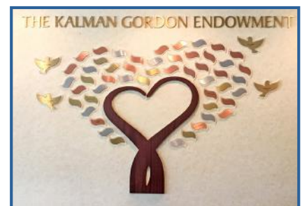
Example of a donor wall at the Gordon Hospice House in Statesville, NC