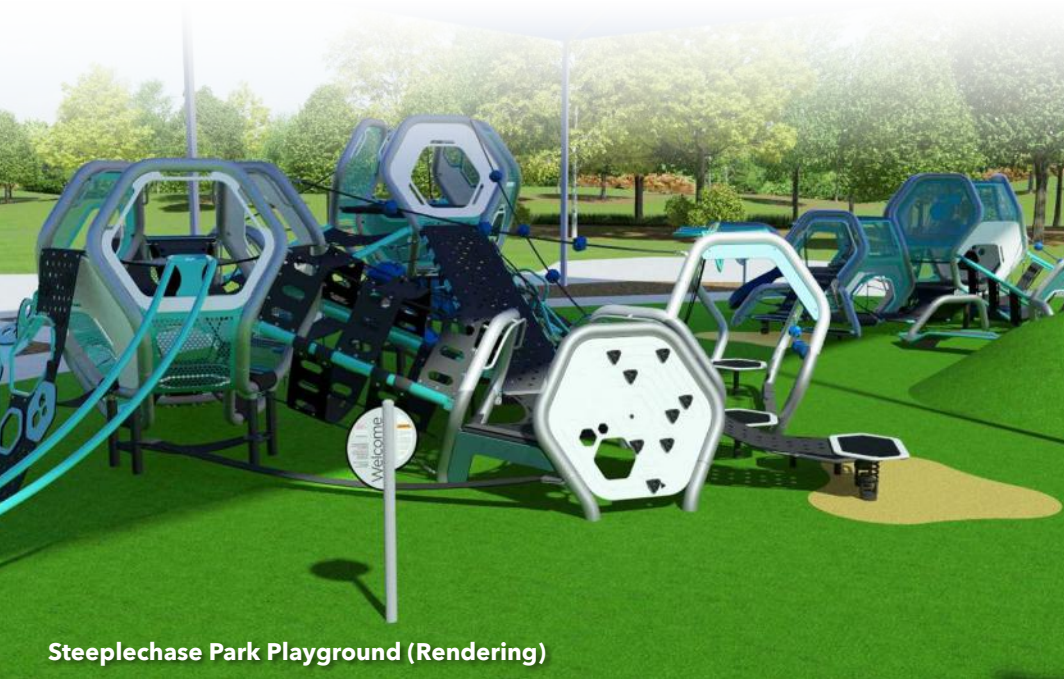
Steeplechase Park Playground (Rendering)

On June 17, Kyle City Council reviewed design plans for four new parking lots, providing 163 total parking stalls (ADA included) at Steeplechase Park. Construction is anticipated to begin in January 2026 with an expected completion of summer 2026.