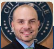
Mayor Travis Mitchell

For more information on current and upcoming road bond projects, visit KyleRoadBonds.com .