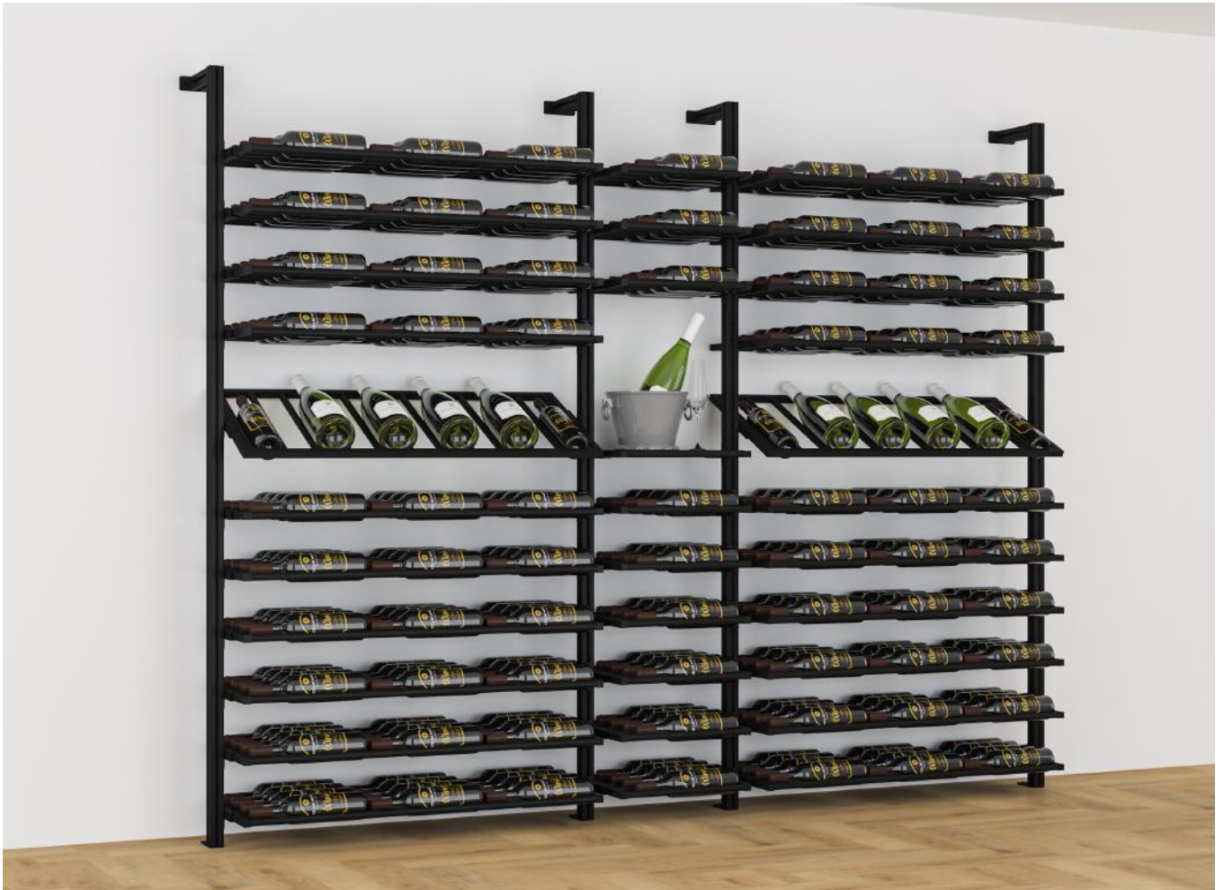
1050 & 420 Combination