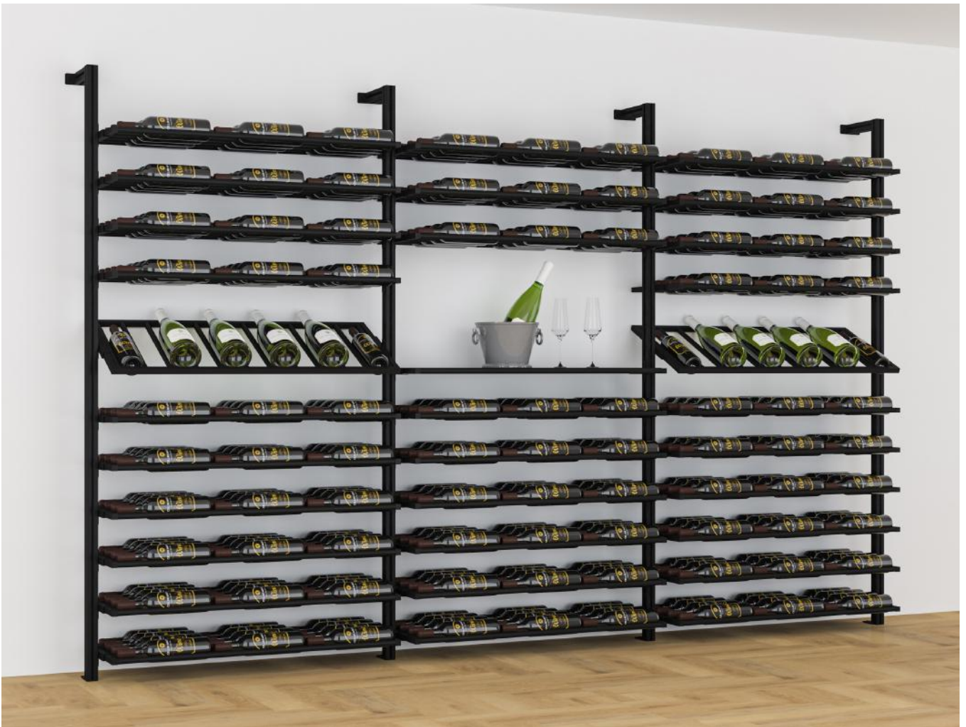
1050 Triple Set