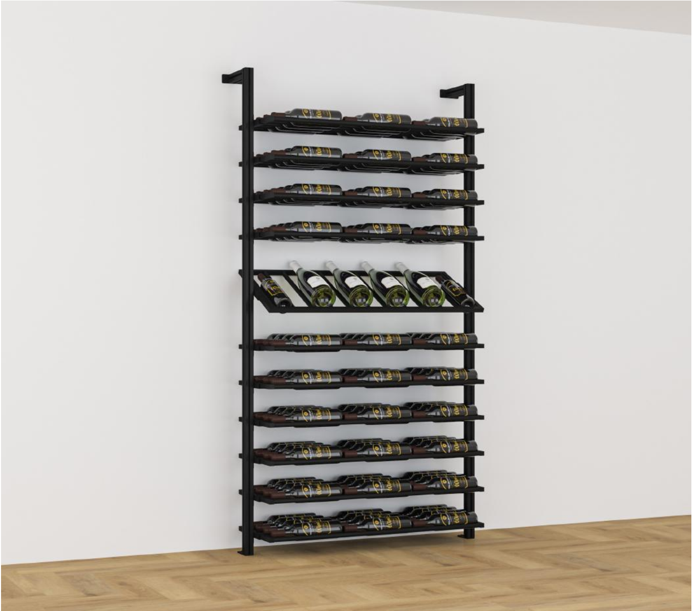
1050 Single Set