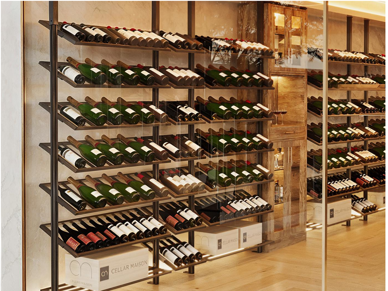
Wine Room - Linear Series