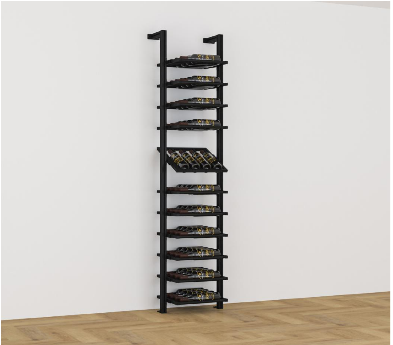
420 Single Set