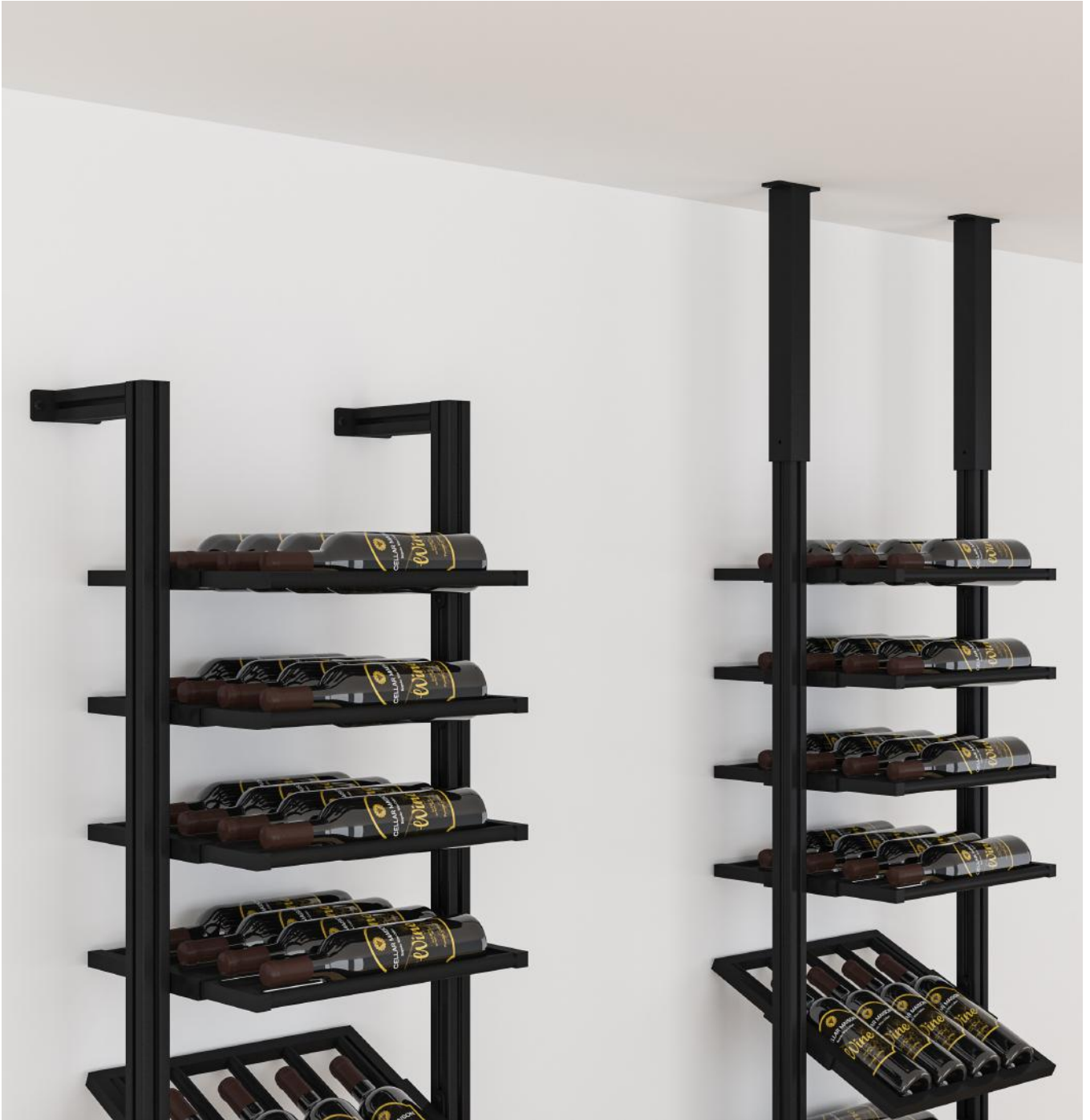
Optional Ceiling or Wall Mounted fixings.