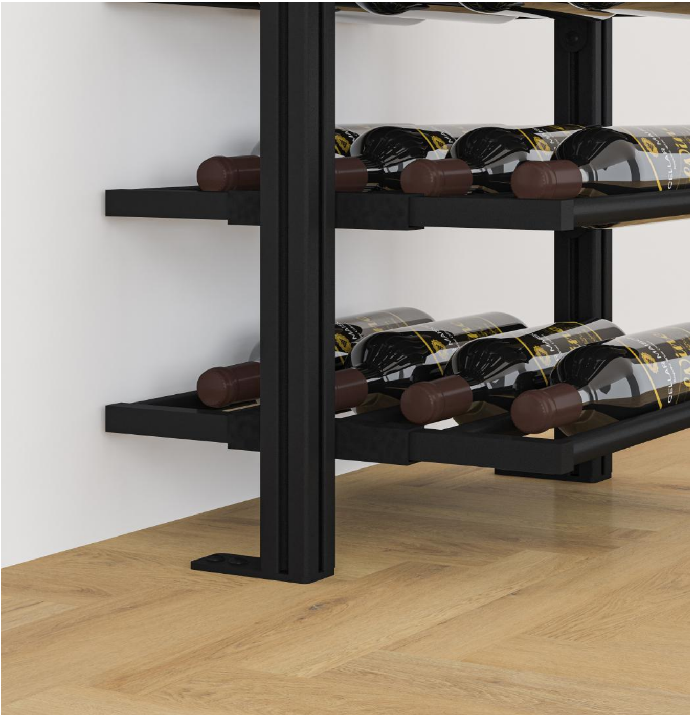
Plates for simple floor fixings