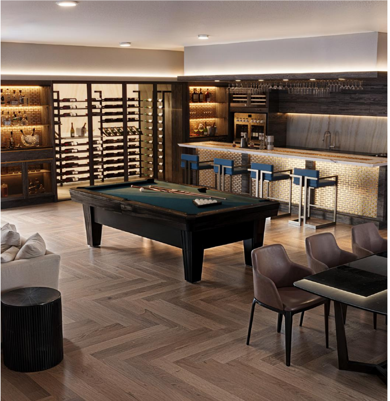
Wine Room - Linear Series

Bespoke drinks cabinets and bar by Cellar Maison*