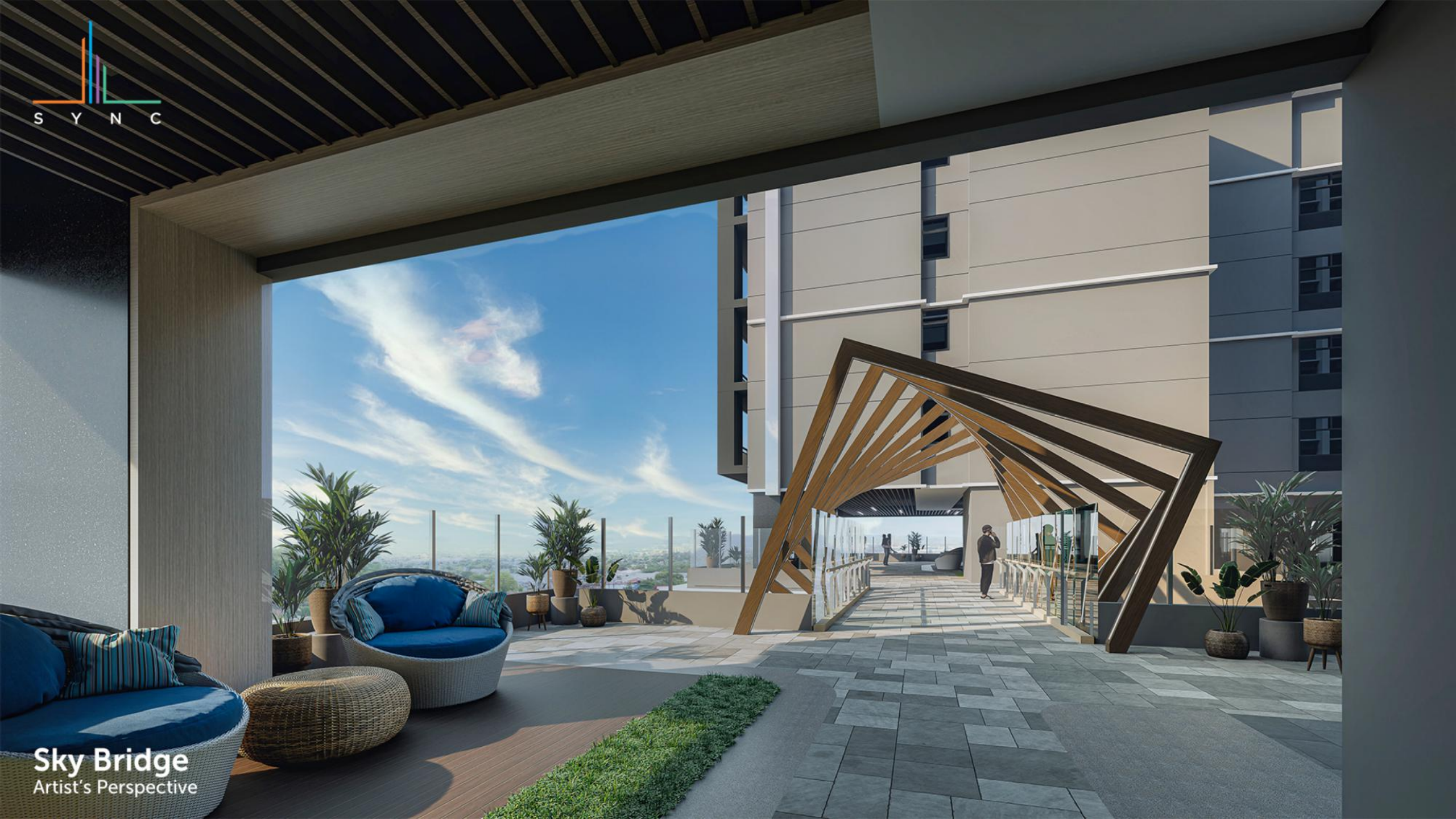
Sky Bridge Artist's Perspective