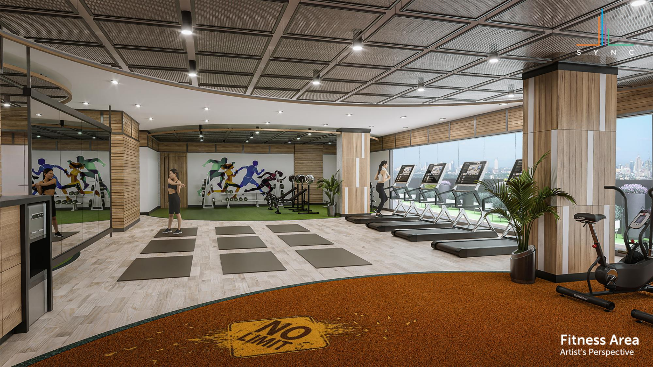
Fitness Area Artist's Perspective