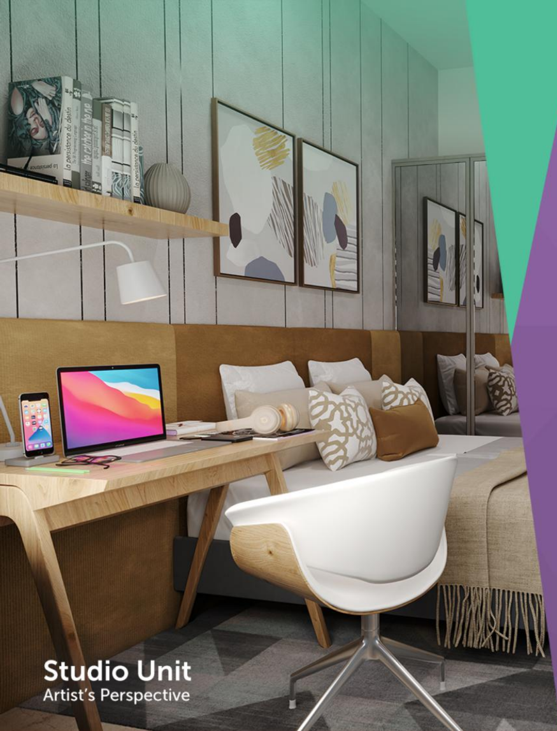
Studio Unit Artist's Perspective