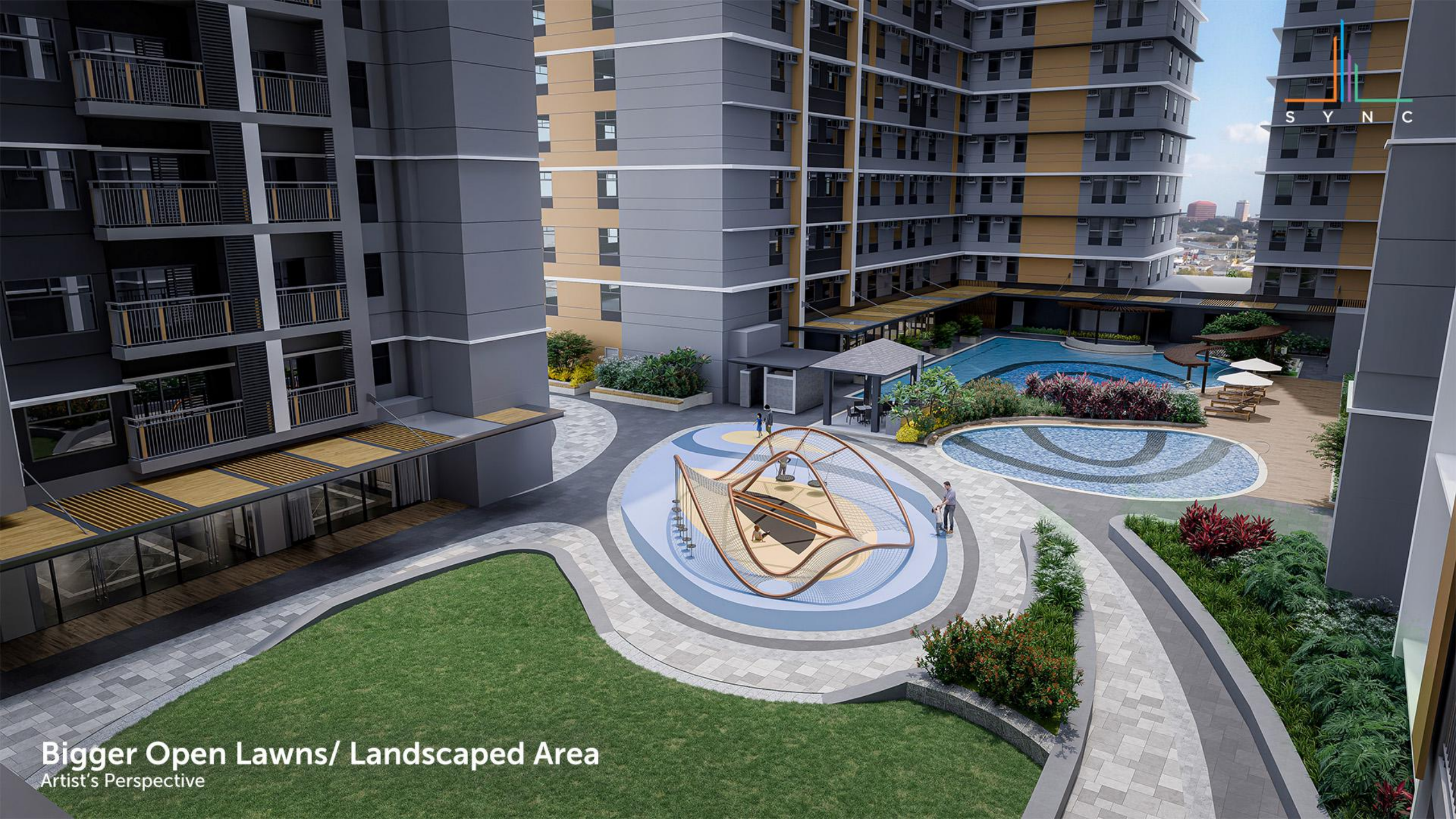
Bigger Open Lawns/ Landscaped Area Artist's Perspective