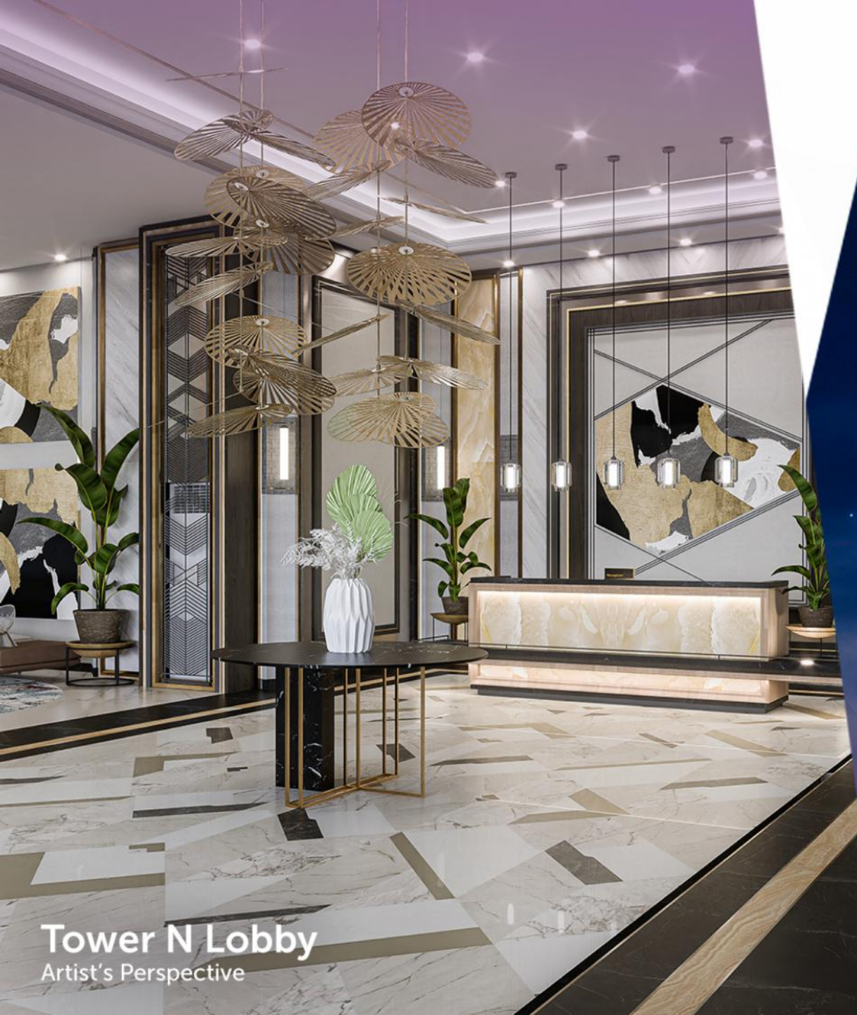
Tower N Lobby Artist's Perspective