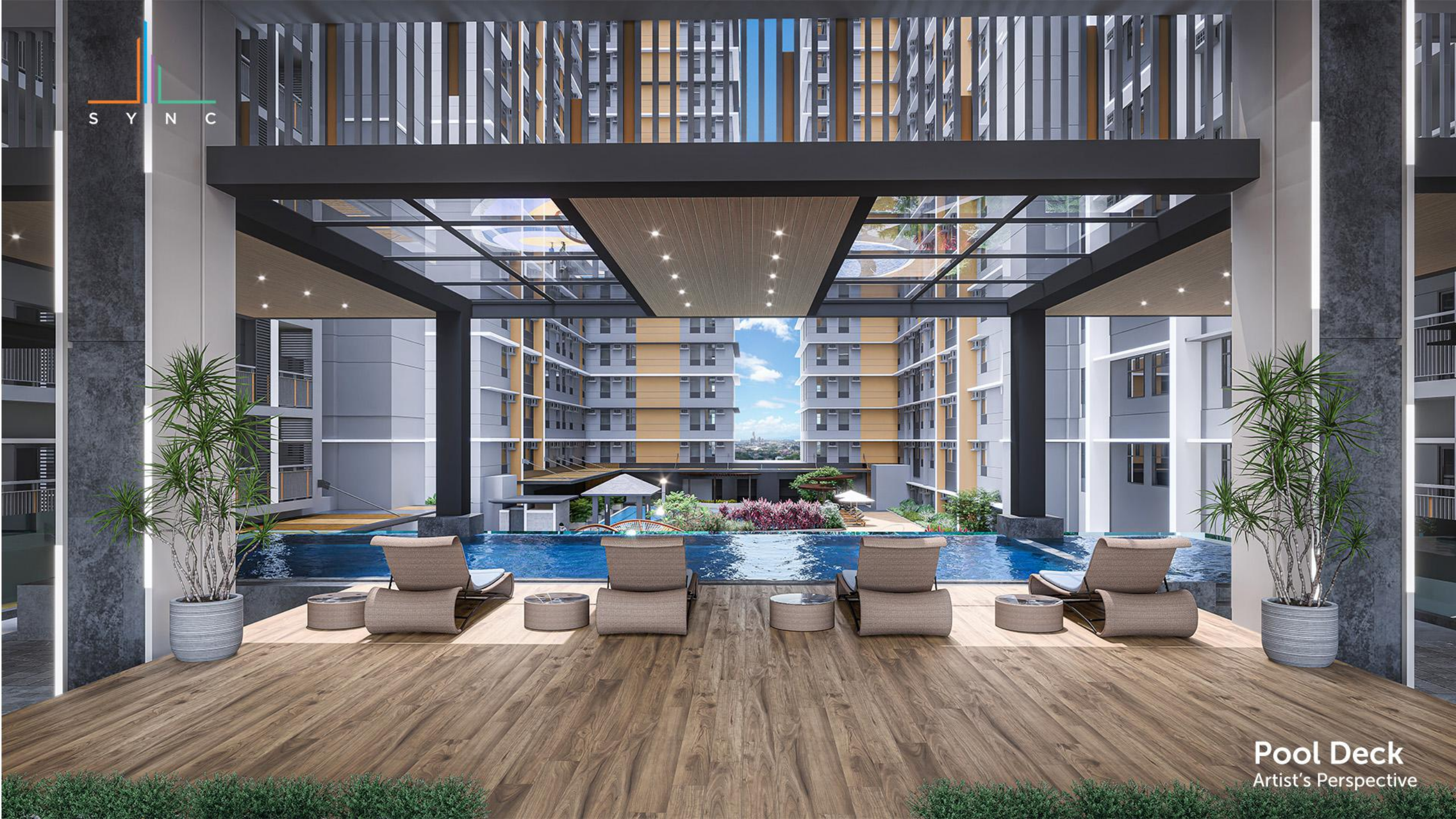
Pool Deck Artist's Perspective