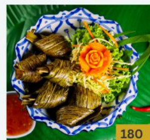
DEEP FRIED HONEY CHICKEN IN PANDAN LEAVES