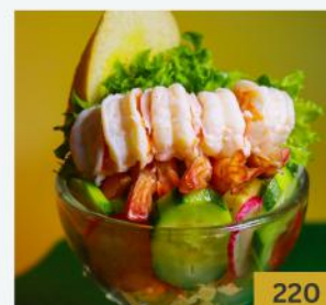
SHRIMP OR SEAFOOD COCKTAIL