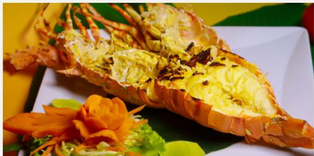
GRILLED LOBSTER WITH SEAFOOD SAUCE