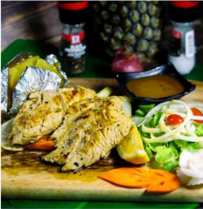
BREAST CHICKEN 350.- STEAK