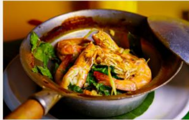
STEAMED PRAWNS WITH THAI HERB