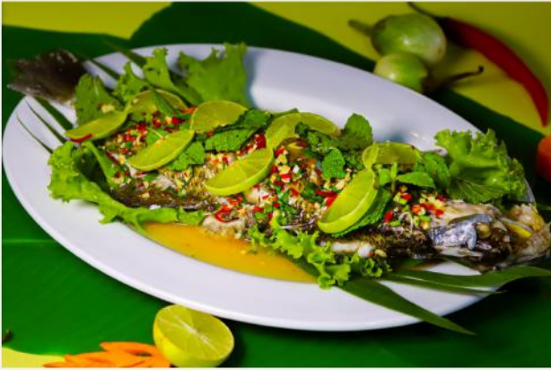
STEAMED FISH WITH LIME, CHILLI AND GARLIC SAUCE