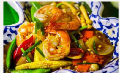
STIR FRIED PRAWNS WITH SMOKED CHILLI SAUCE