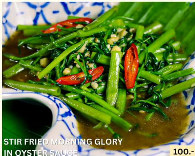
STIR FRIED MORNING GLORY IN OYSTER SAUCE