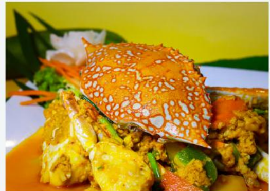
STIR FRIED WITH YELLOW CURRY POWDER