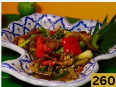
STIR FRIED SOFT SHELL CRAB WITH BLACK PEPPER SAUCE