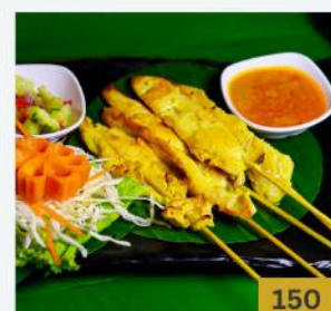
CHICKEN OR PORK SATAY