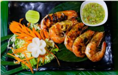
GRILLED PRAWNS WITH SPICY SEAFOOD SAUCE