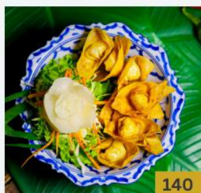
DEEP FRIED WONTON MINCED CHICKEN OR PORK