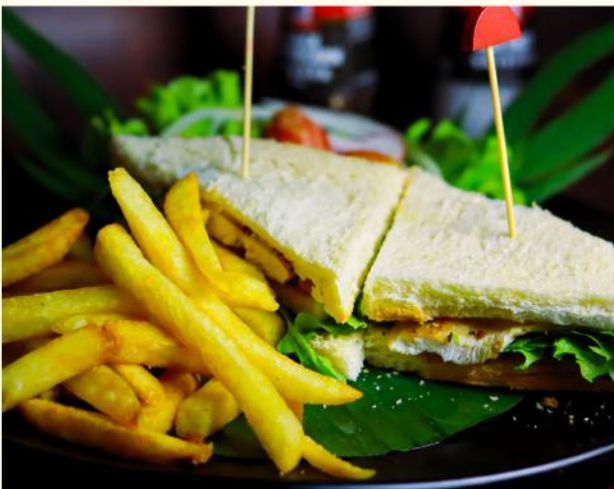
GRILLED CHICKEN SANDWICH