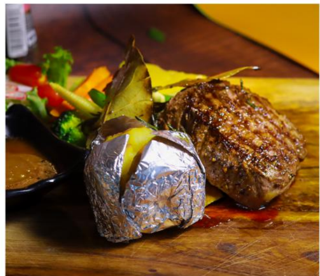
TENDERLOIN STEAK 790.-

All dishes of steak are served with French Fries, Mashed Potatoes, Season Vegetables, Steamed Rice, Baked Potato