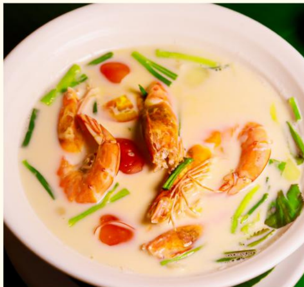
TOM KHA SOUP