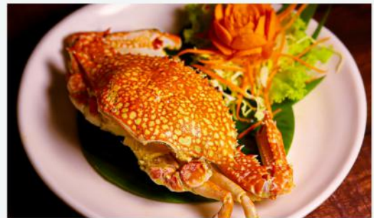
STEAMED CRAB WITH SEAFOOD SAUCE