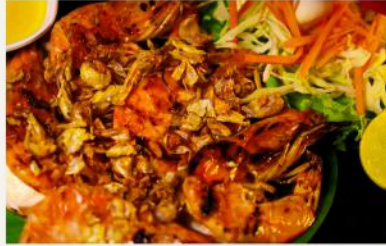
GRILLED PRAWNS TOP GARLIC AND PEPPER