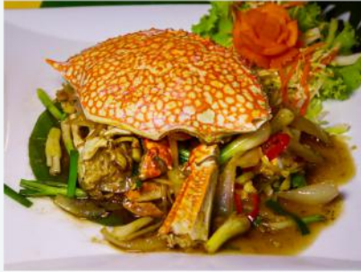
STIR FRIED CRAB WITH ONION RINGS