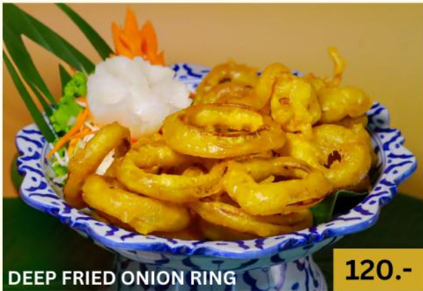
DEEP FRIED ONION RING