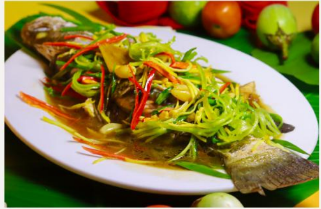
STEAMED FISH WITH GINGER AND SOY SAUCE