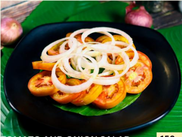
TOMATO AND ONION SALAD