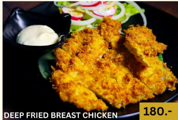
DEEP FRIED BREAST CHICKEN