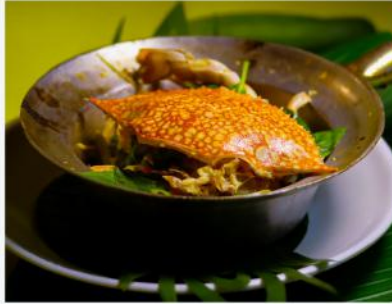
STEAMED CRAB WITH THAI HERB SAUCE