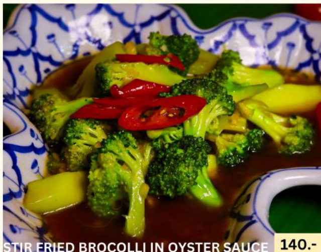
STIR FRIED BROCCOLI IN OYSTER SAUCE