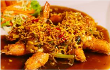
FRIED PRAWNS TOP TAMARIND SAUCE