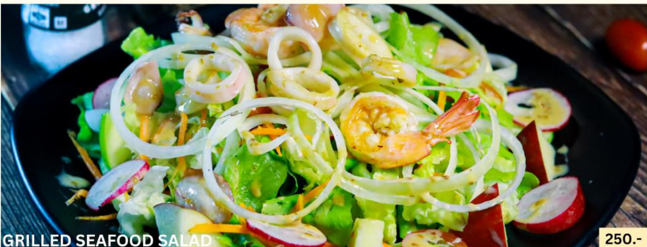
GRILLED SEAFOOD SALAD