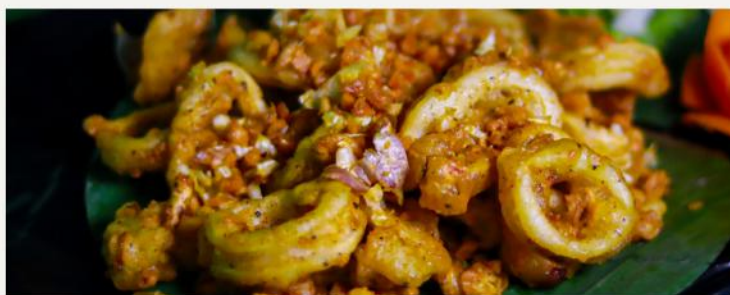
DEEP FRIED SQUID WITH DRY GARLIC AND PEPPER