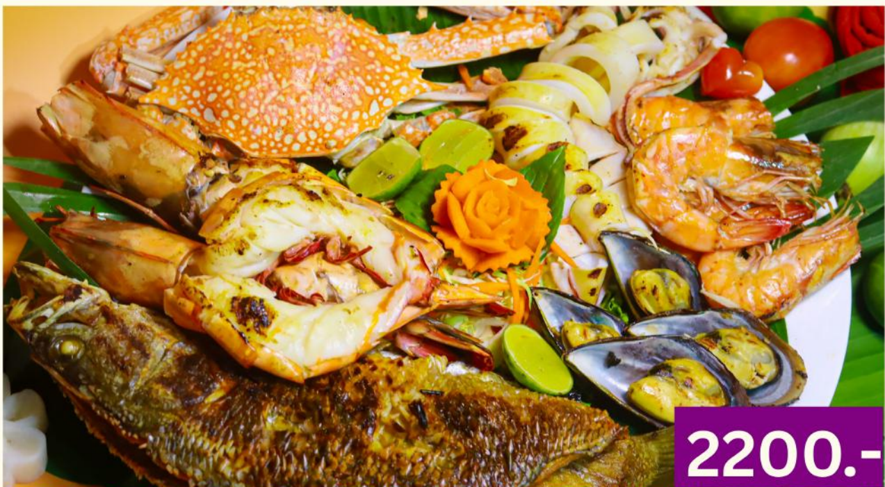
SEAFOOD BASKET SET - 1 PHUKET LOBSTER, TIGER PRAWNS, WHITE PRAWNS, WHITE SNAPPER FISH, CRAB, SQUID, MUSSEL