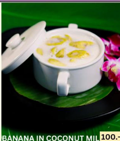
BANANA IN COCONUT MIL 100.-