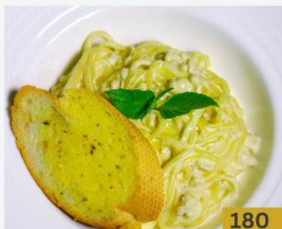
CHICKEN CREAM SAUCE