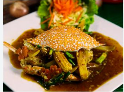
STIR FRIED WITH SMOKED CHILLI