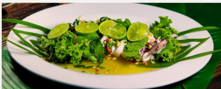
STEAMED SQUID WITH LIME, CHILLI AND GARLIC SAUCE