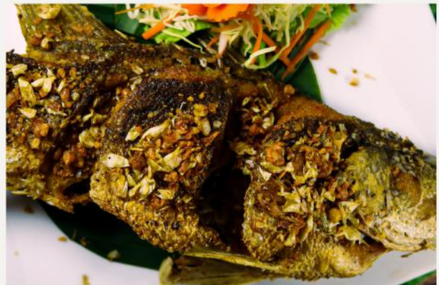
DEEP FRIED FISH WITH DRY GARLIC AND BLACK PEPPER