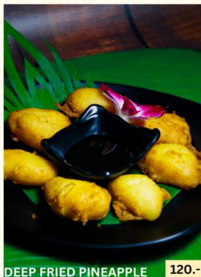
DEEP FRIED PINEAPPLE 120.-