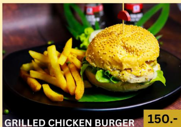
GRILLED CHICKEN BURGER