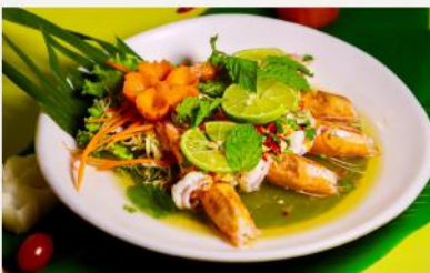
STEAMED PRAWNS WITH LIME, CHILLI AND GARLIC SAUCE