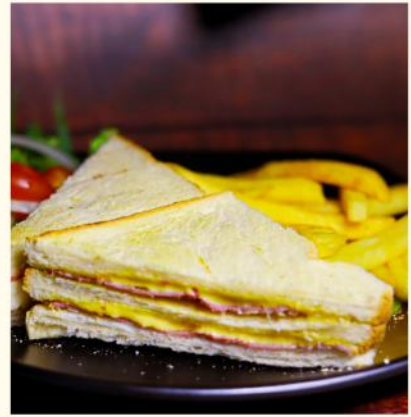
HAM CHEESE SANDWICH