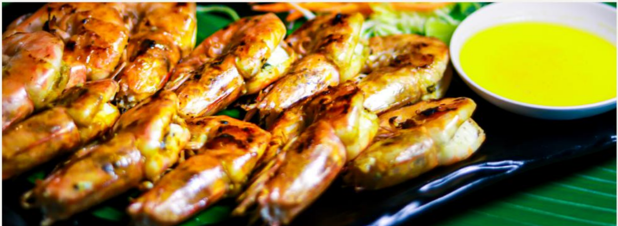
GRILLED PRAWNS WITH GARLIC AND BUTTER SAUCE