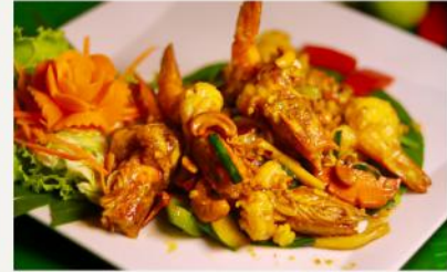
STIR FRIED PRAWNS WITH CASHEW NUTS