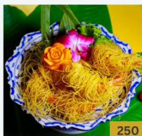
DEEP FRIED PRAWNS WRAPPED PHUKET NOODLE