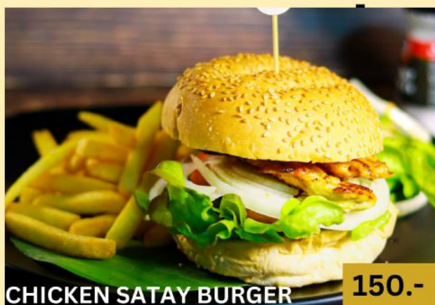
CHICKEN SATAY BURGER