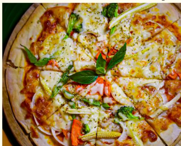
MIXED VEGETABLES PIZZA