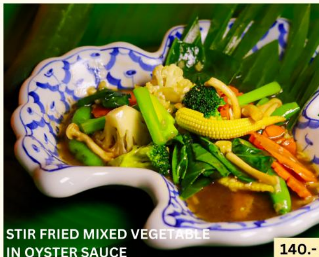
STIR FRIED MIXED VEGETABLE IN OYSTER SAUCE