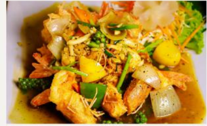
STIR FRIED PRAWNS WITH BLACK PEPPER SAUCE