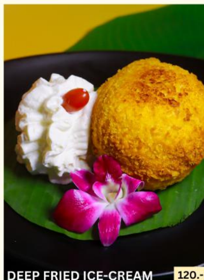
DEEP FRIED ICE-CREAM 120.-