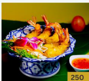
TEMPURA PRAWN, SQUID, SEAFOOD