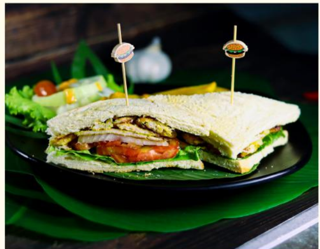
CHICKEN SATAY SANDWICH