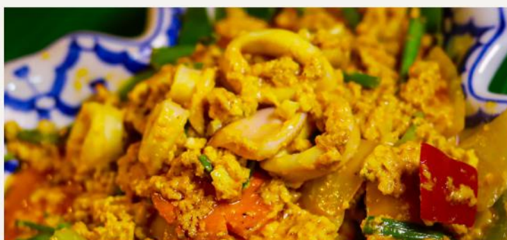
STIR FRIED SQUID WITH YELLOW CURRY POWDER