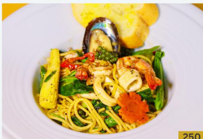
SPICY SEAFOOD IN THAI STYLE