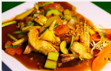
DEEP FRIED PRAWNS WITH SWEET AND SOUR SAUCE