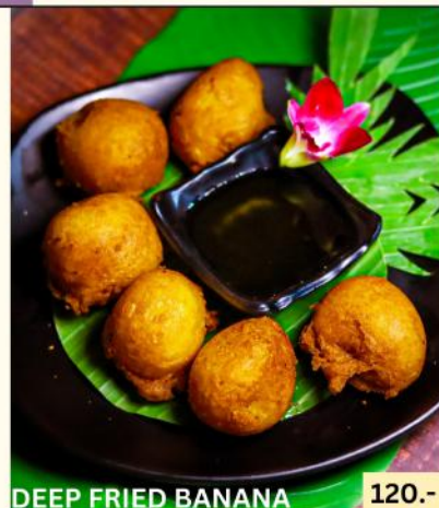
DEEP FRIED BANANA 120.-