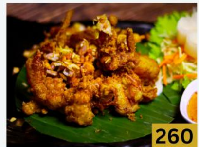
DEEP FRIED SOFT SHELL CRAB WITH DRY GARLIC AND PEPPER