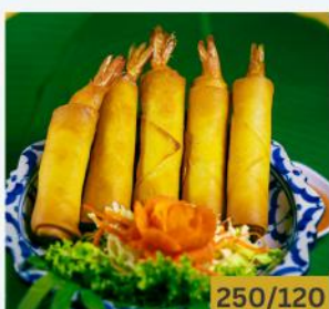
SPRING ROLL PRAWNS OR VEGETABLES