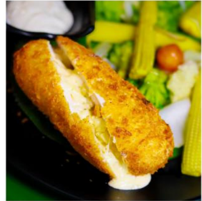
CORDON BLEU 350.-