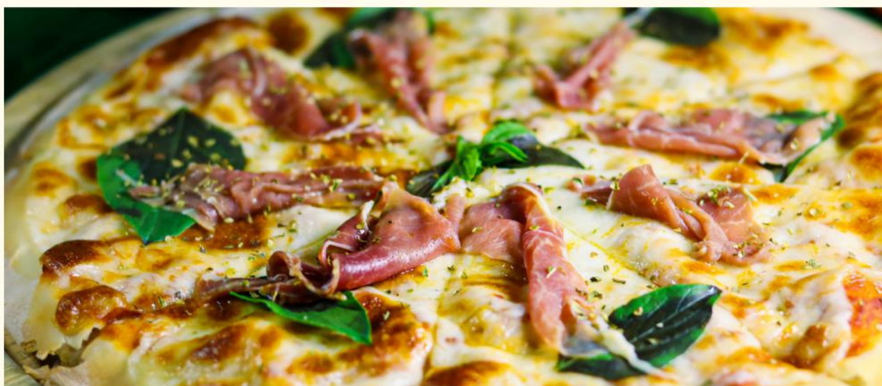
PARMA HAM PIZZA