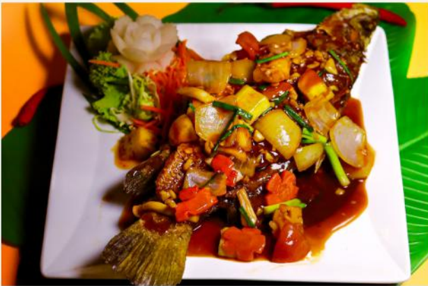
DEEP FRIED FISH WITH SWEET AND SOUR SAUCE