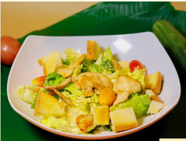
CAESAR SALAD WITH CHICKEN