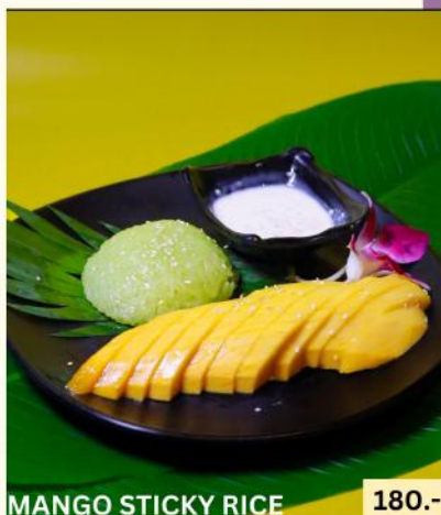
MANGO STICKY RICE 180.-