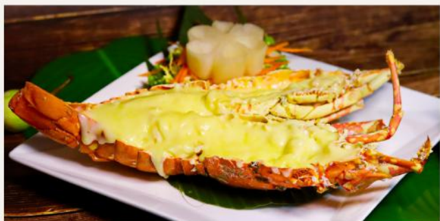
BAKED LOBSTER WITH CHEESE AND GARLIC SAUCE