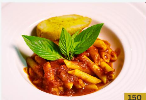
PENNE WITH TOMATO SAUCE