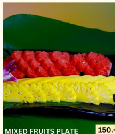
MIXED FRUITS PLATE 150.-