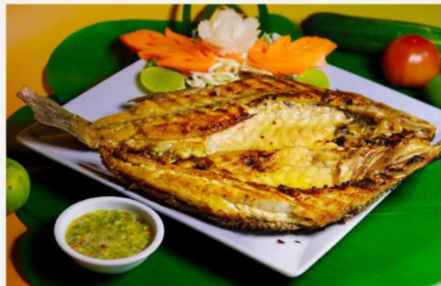
GRILED FISH WITH SPICY SEAFOOD SAUCE