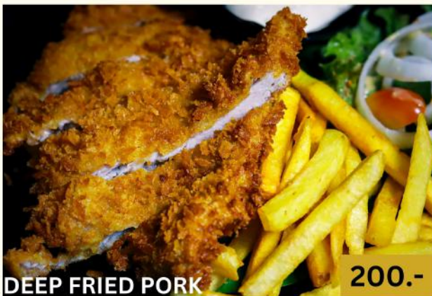
DEEP FRIED PORK