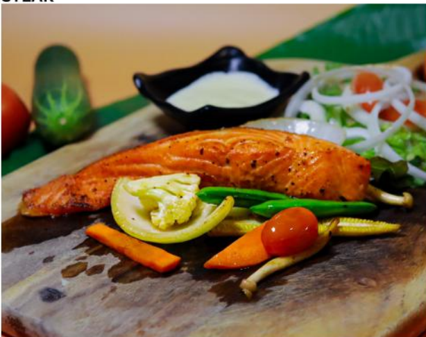
SALMON STEAK 390.-