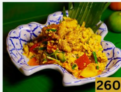
STIR FRIED SOFT SHELL CRAB WITH YELLOW CURRY POWDER