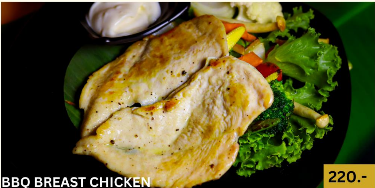
BBQ BREAST CHICKEN