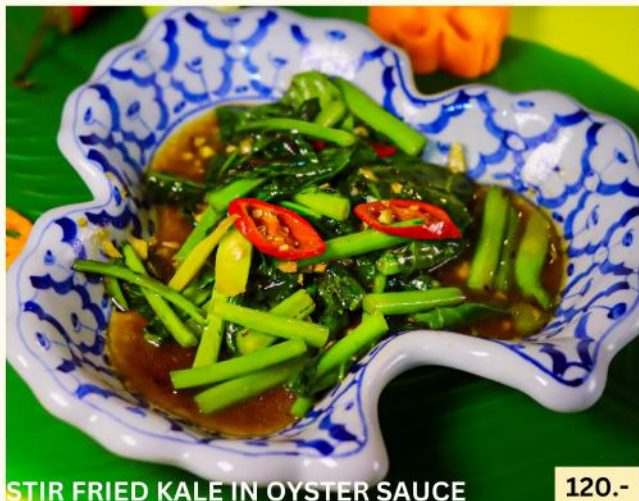
STIR FRIED KALE IN OYSTER SAUCE