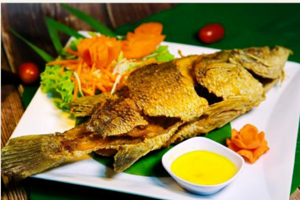
GRILLED OR DEEP FRIED FISH WITH GARLIC AND BUTTER SAUCE