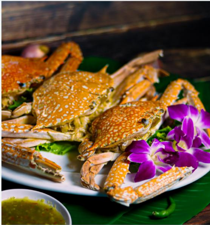
GRILLED CRAB WITH SEAFOOD SAUCE