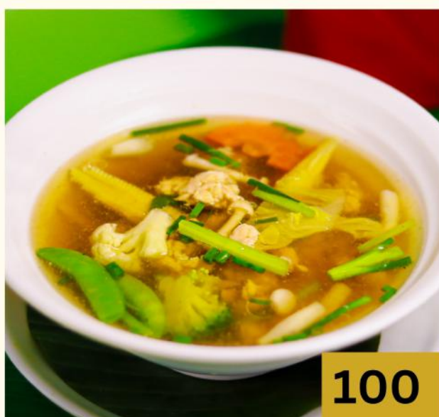
CLEAR VEGETABLES SOUP