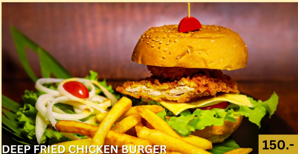
DEEP FRIED CHICKEN BURGER