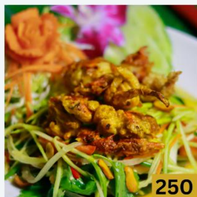
FRESH PRAWNS MARINATED IN SPICY FISH SAUCE