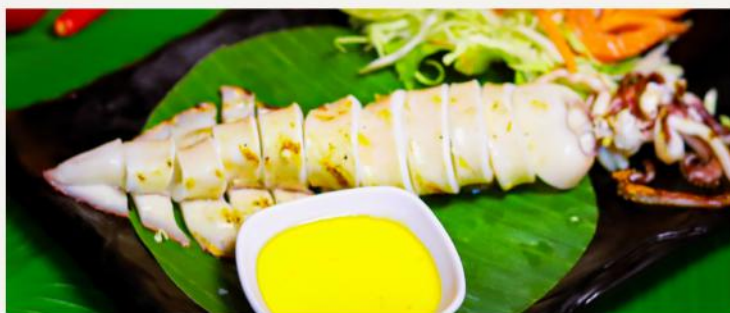
GRILLED SQUID WITH GARLIC AND BUTTER SAUCE