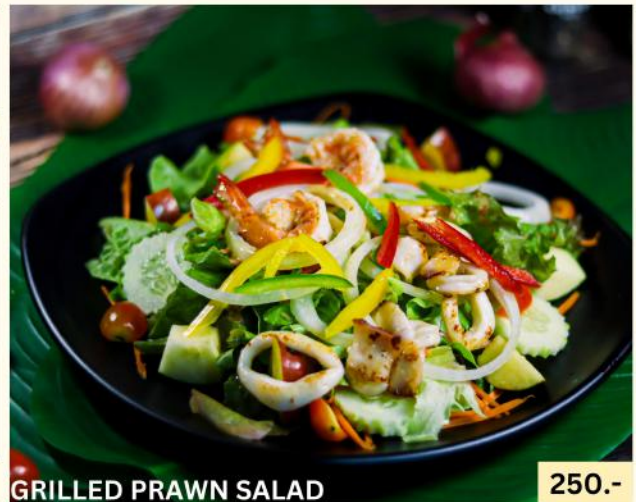
GRILLED PRAWN SALAD