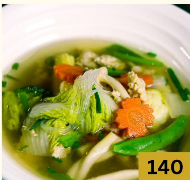
CLEAR GLASS NOODLE SOUP CHICKEN OR PORK