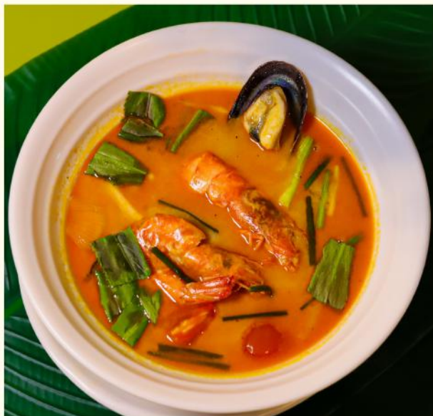
TOM YUM SOUP