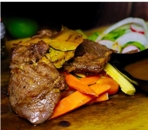
RIB EYES STEAK 790.-