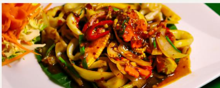
STIR FRIED SQUID WITH SMOKED CHILLI SAUCE