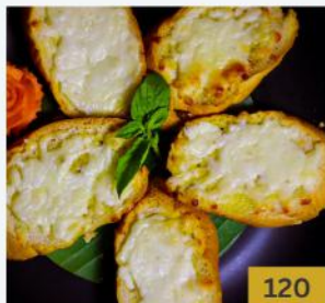
GARLIC BREAD WITH CHEESE