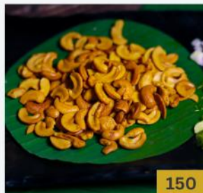
DEEP FRIED CASHEW NUT