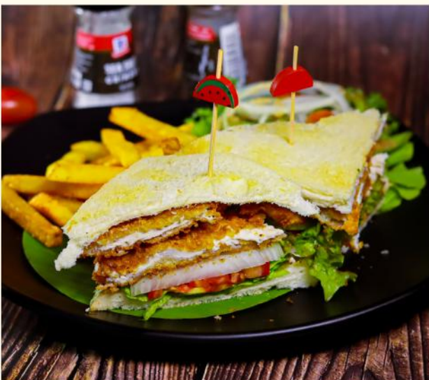
DEEP FRIED CHICKEN SANDWICH