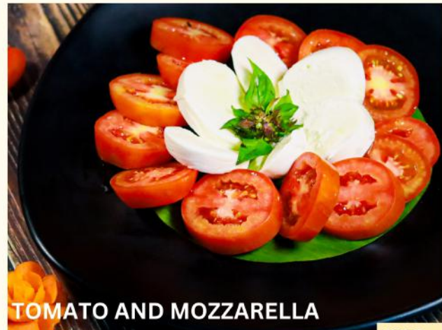
TOMATO AND MOZZARELLA CHEESE SALAD