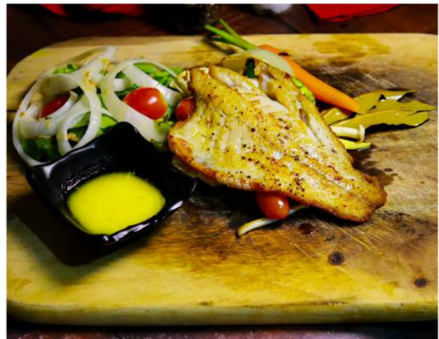
WHITE SNAPPER FISH STEAK 390.-