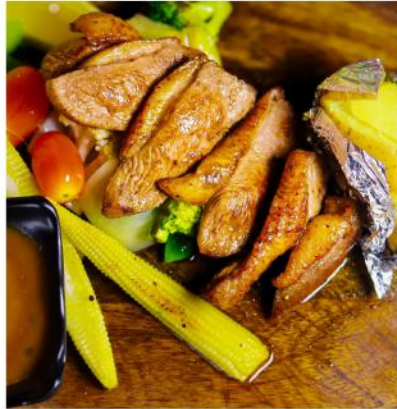
BREAST DUCK STEAK 380.-