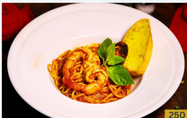
SEAFOOD IN TOMATO SAUCE