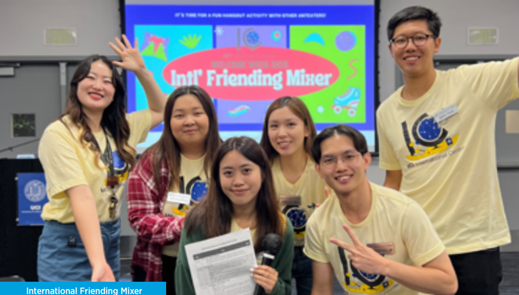
International Friending Mixer