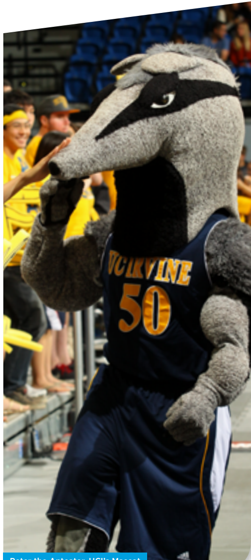
Peter the Anteater, UCI's Mascot

Rainy season in Southern California runs from December to March.