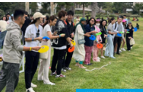
Welcome Picnic 2023

The New International Graduate Student Orientation helps new international students navigate their graduate career at UC Irvine. This event, in addition to school/department-based orientations, covers common aspects of the UCI international graduate student experience. Sessions include graduate support services as well as important administrative topics. This event gives new international graduate students the opportunity to connect with fellow international students from other disciplines across campus.