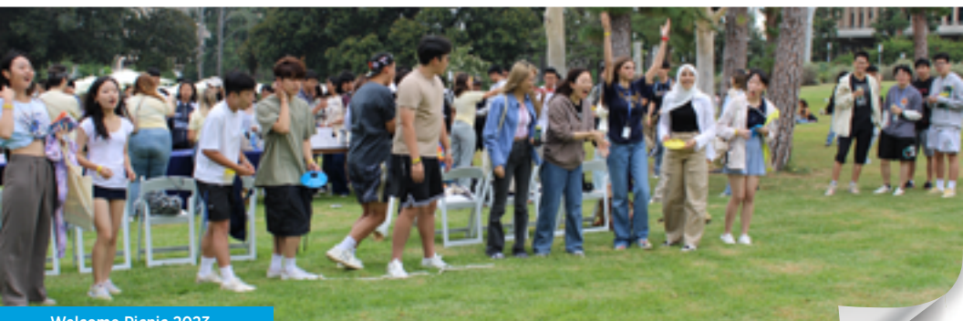
Welcome Picnic 2023