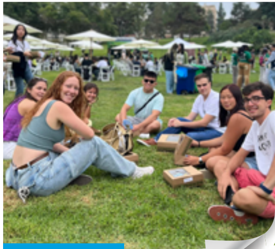
Welcome Picnic 2023