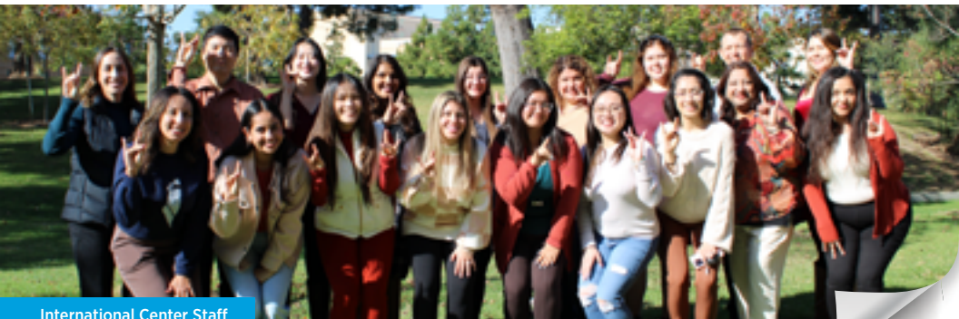
International Center Staff

Cars driven in California must be registered through the Department of Motor Vehicles. Evidence of financial responsibility must be carried at all times in the vehicle. Most Californians maintain financial responsibility through insurance companies, which provide the policy holder (you) with an identification card as evidence of coverage. The card must state the insurance company's name, address, period of coverage and policy number.