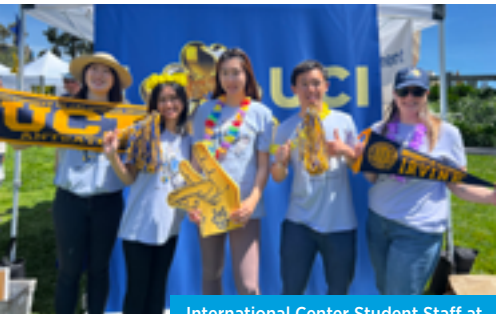
International Center Student Staff at Celebrate UCI

Carry your new address information with your immigration documents when you travel because you will need the specific address of your destination.