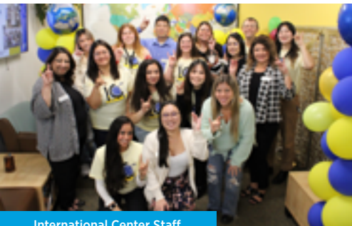
International Center Staff

THE UCI INTERNATIONAL CENTER IS YOUR ONLY SOURCE FOR VISA INFORMATION.