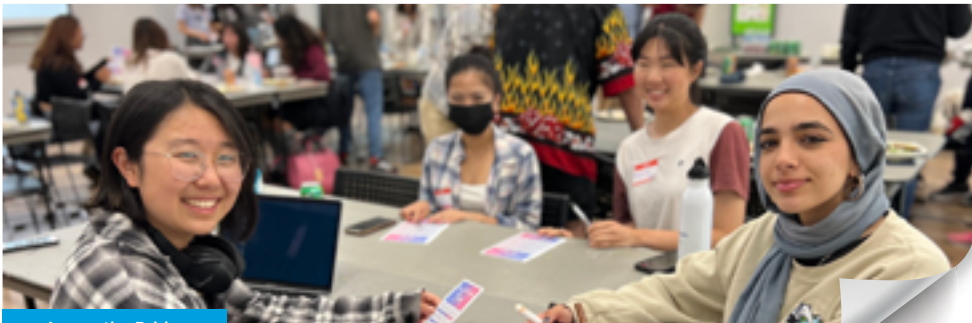
Across the Bridge