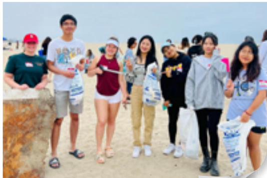
Helping Hands Beach Clean Up

The International Center offers employment, internship, and volunteer opportunities to all students. Gain professional and leadership experience with the International Center!