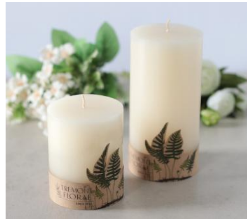
CL2345-028 Ivory 3x4" CL2343-028 Ivory 3x6"