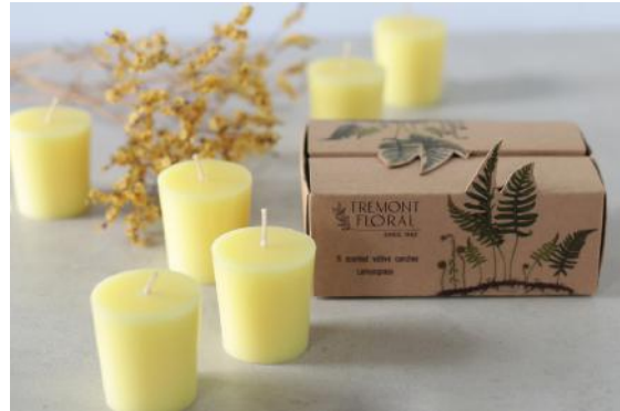
CL2344-005 Lemongrass Scent