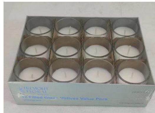
CL5819-003 2.1" HT OF GLASS