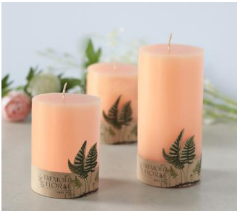
CL2345-009 Peach 3x4" CL2343-009 Peach 3x6"