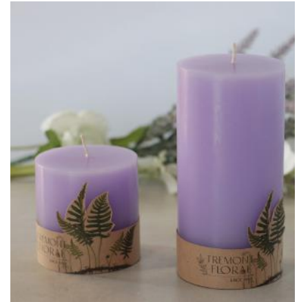
CL2345-008 Lavender 3x4" CL2343-008 Lavender 3x6"