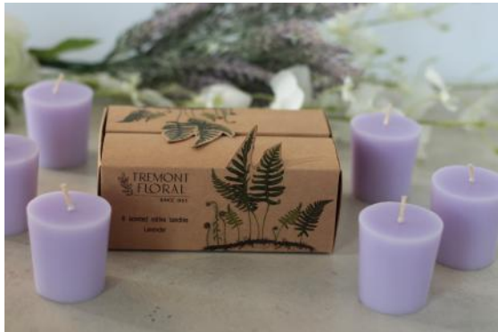
CL2344-008 Lavender Scent