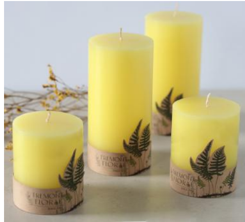
CL2345-005 Yellow 3x4" CL2343-005 Yellow 3x6"