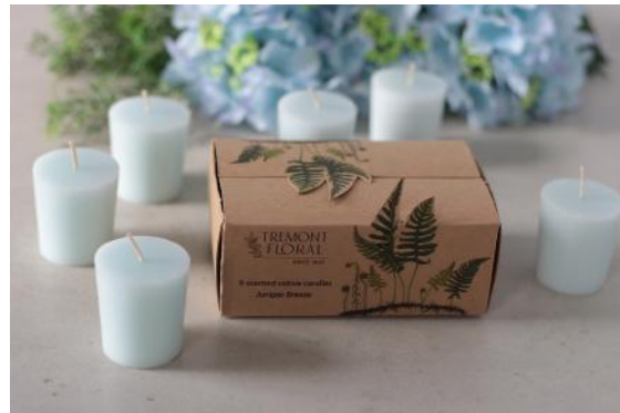
CL2344-032 Juniper Breeze Scent