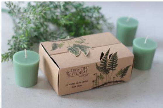
CL2344-063 Guava Water Hyacinth