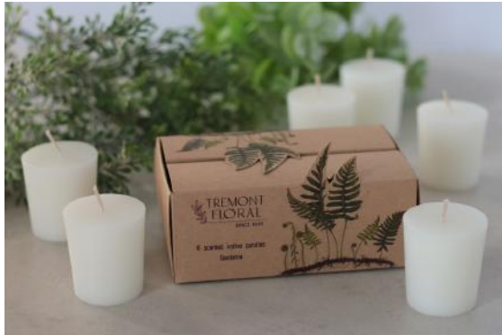
CL2344-003 Gardenia Scent