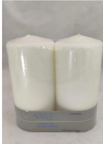
CL5828-003 3 X6"