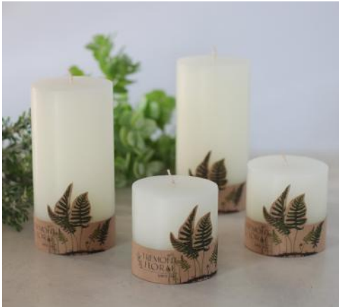
CL2345-003 White 3x4" CL2343-003 White 3x6"