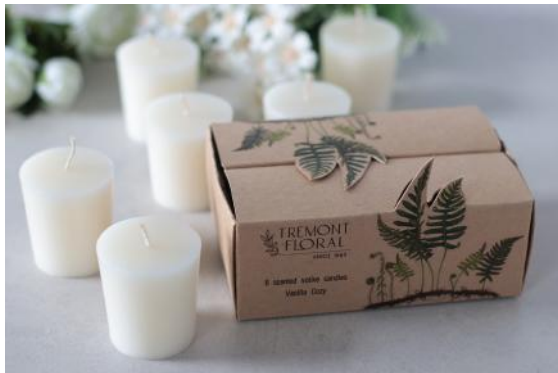
CL2344-028 Vanilla Cozy Scent