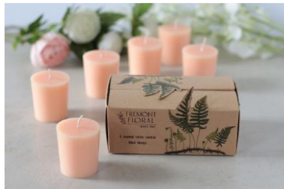
CL2344-009 Maui Mango Scent