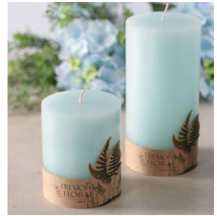
CL2345-032 Lt Blue 3x4" CL2343-032 Lt Blue 3x6"