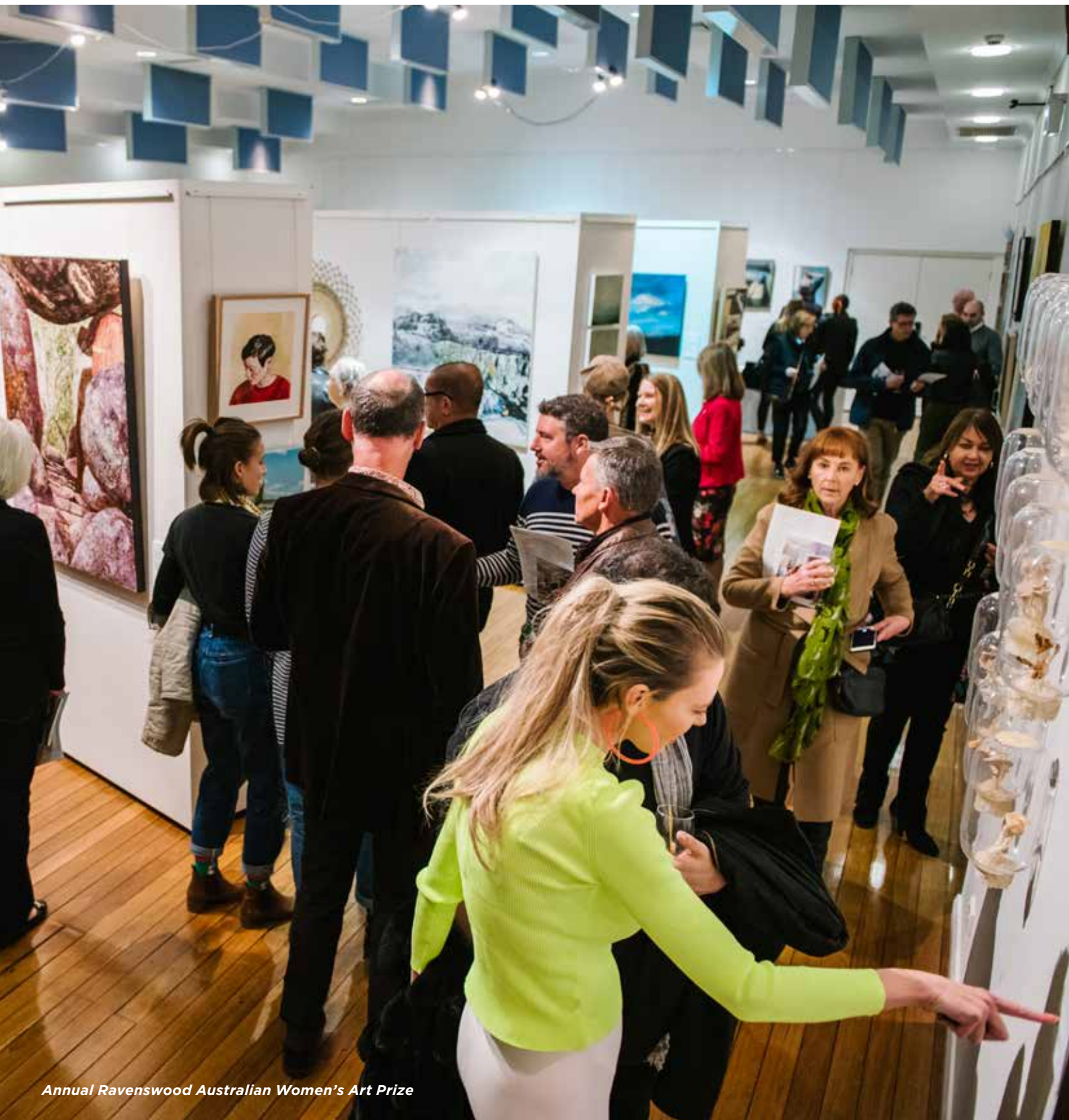
Annual Ravenswood Australian Women's Art Prize