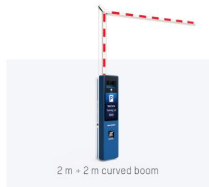
2 m + 2 m curved boom