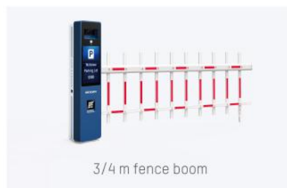
3/4 m fence boom