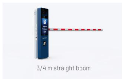
3/4 m straight boom