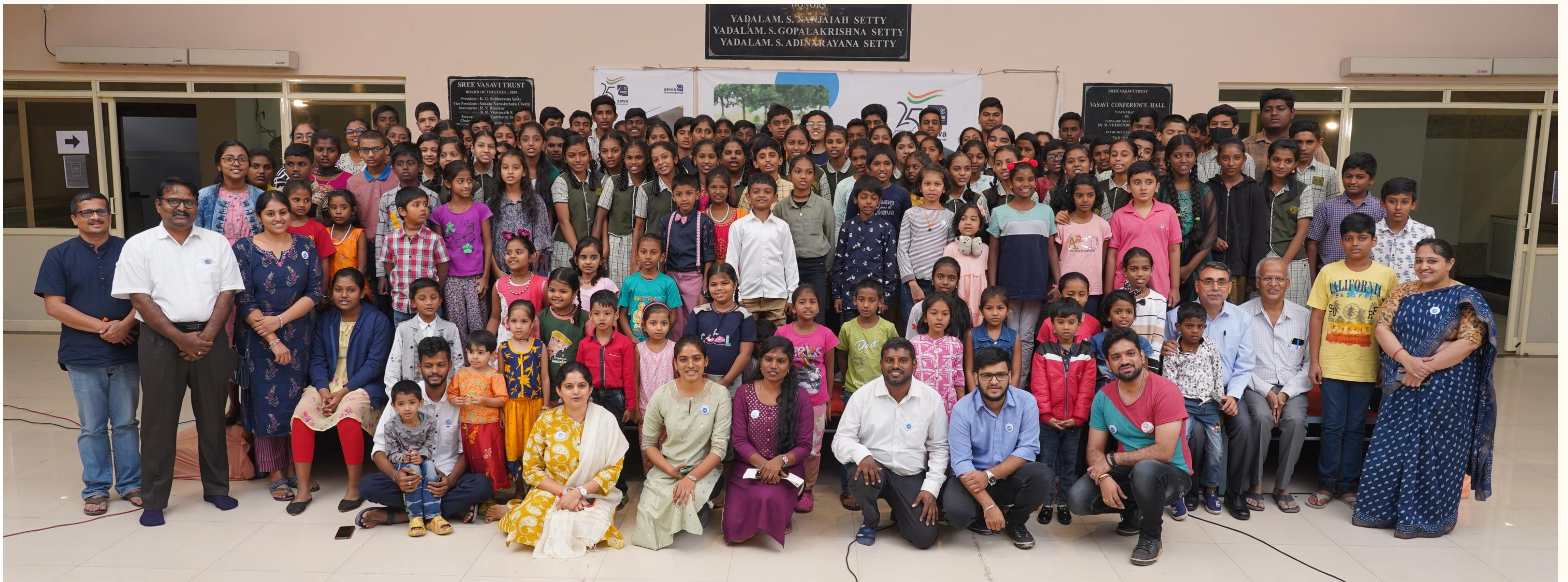
SAC Supported Children with Volunteers in Bengaluru, Karnataka on December 4, 2022

The Sponsor a Child (SAC) program witnessed phenomenal growth in 2022, enabling 10,000 children from low-income families across India, Colombia, Iraq, and Pakistan to pursue their education. India alone accounted for 9,840 children supported by SAC.