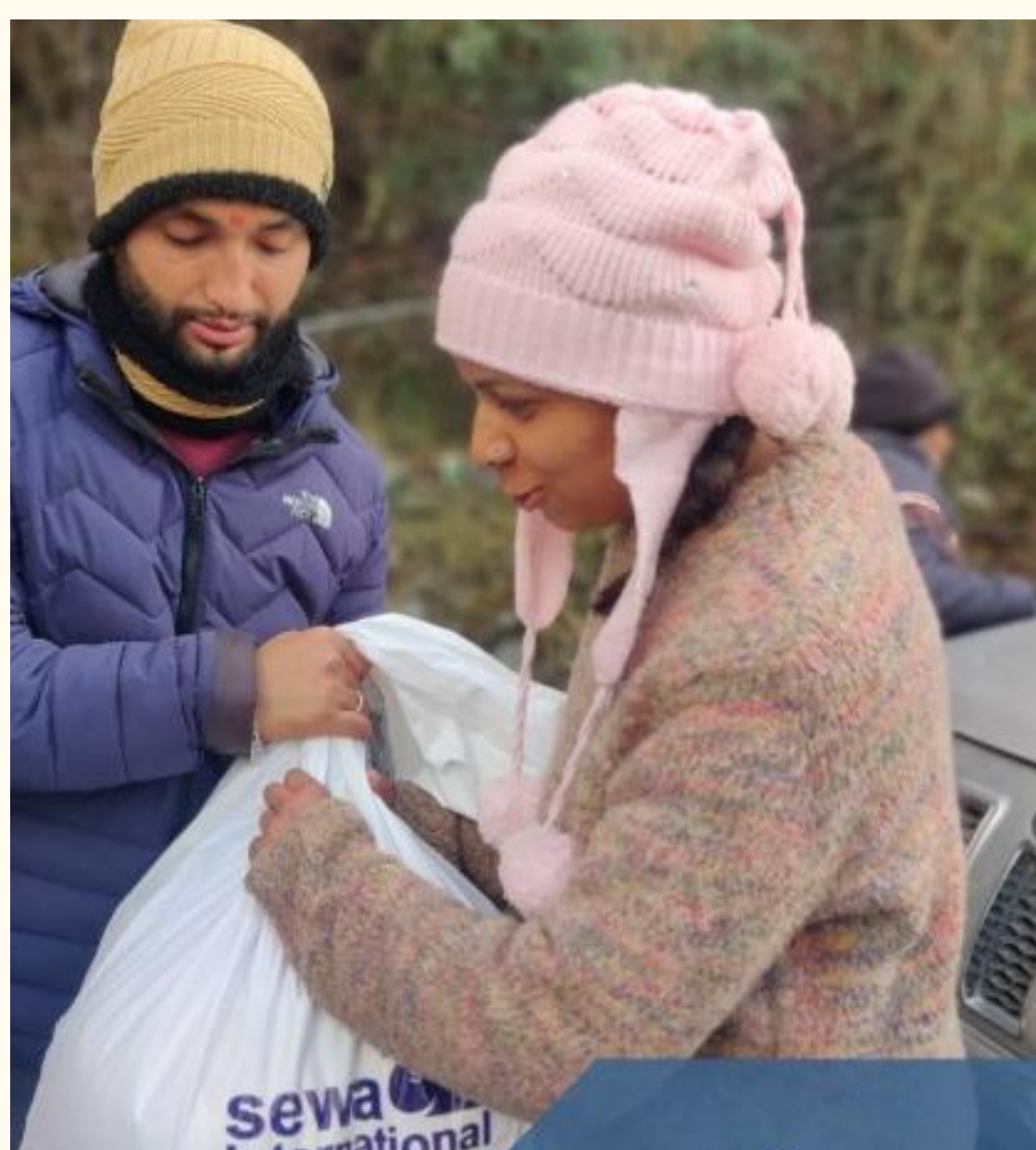
Sewa Relief Work at Joshimath

Joshimath, a sacred town in the Himalayas, is in trouble. The floods in February 2021 caused landslides, and over 700 homes developed cracks by January 2023. Broken roads and tilting buildings created fear. The district administration demolished damaged homes and buildings, including some hotels, and moved the residents to temporary shelters.