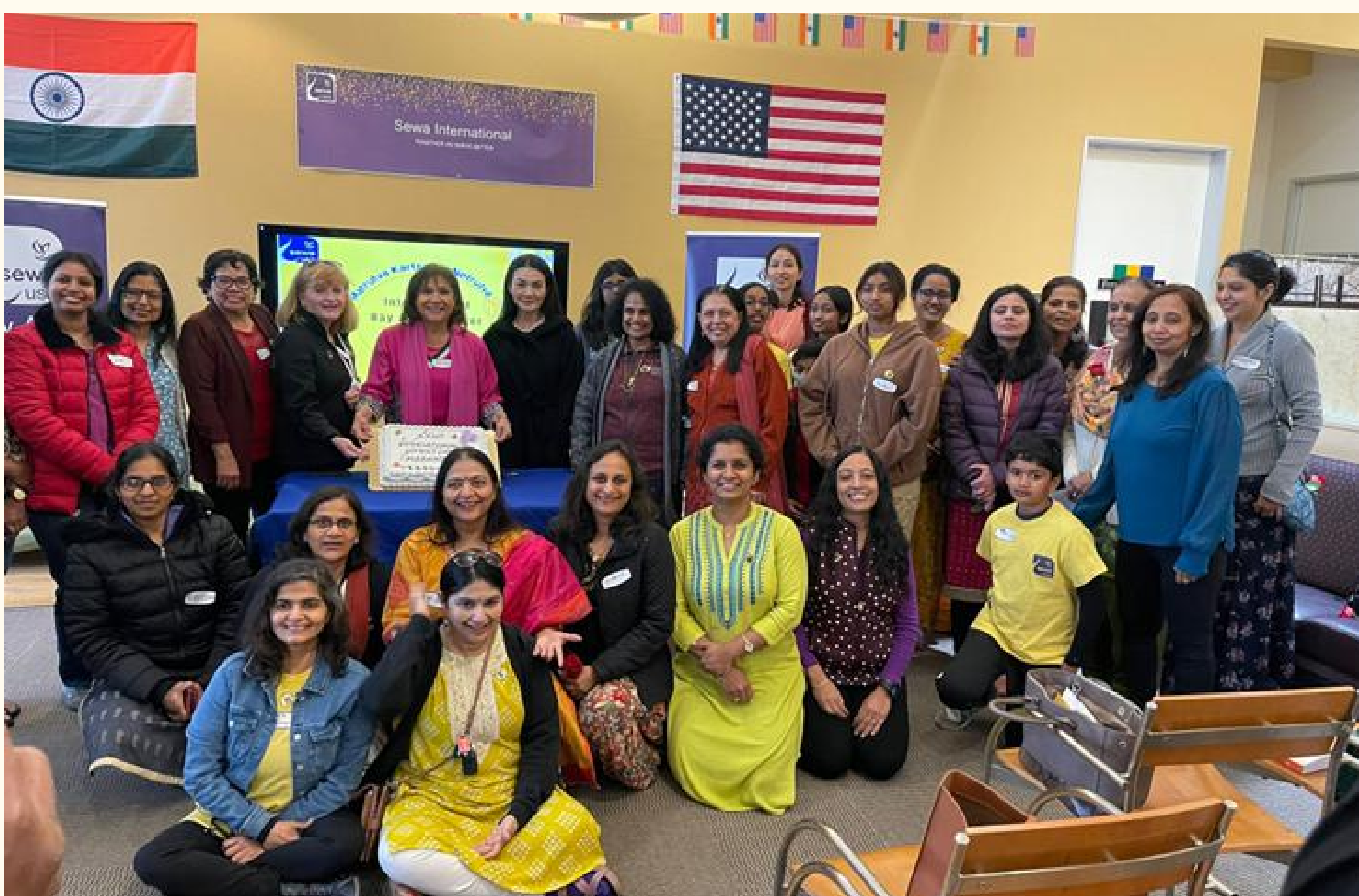
Sewa's women volunteers at the Sewa Community Center in Milpitas, CA