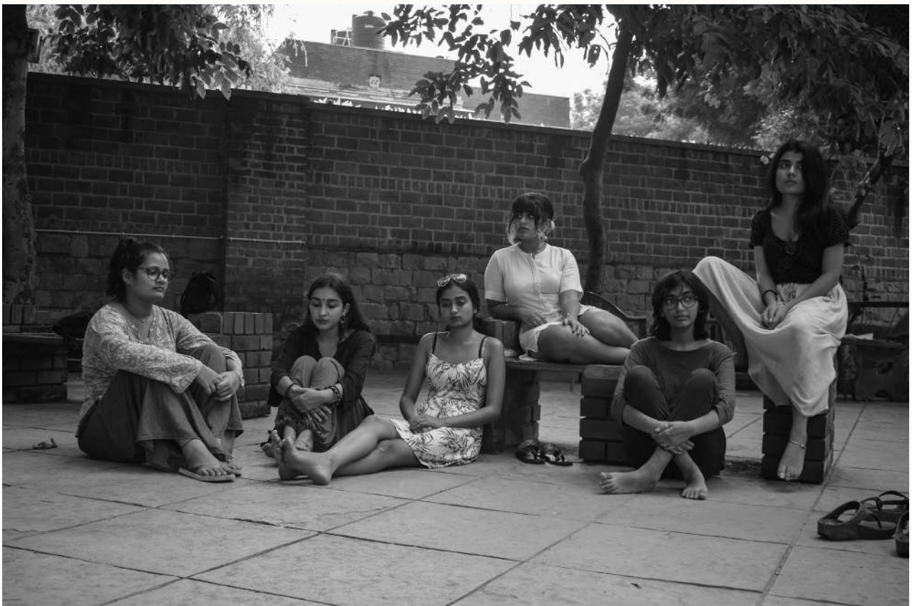
3.4 Understanding self-care as also consisting of building communities of solidarity and healing; communities as channels through which one can seek institutional accountability for psychosocial distress.