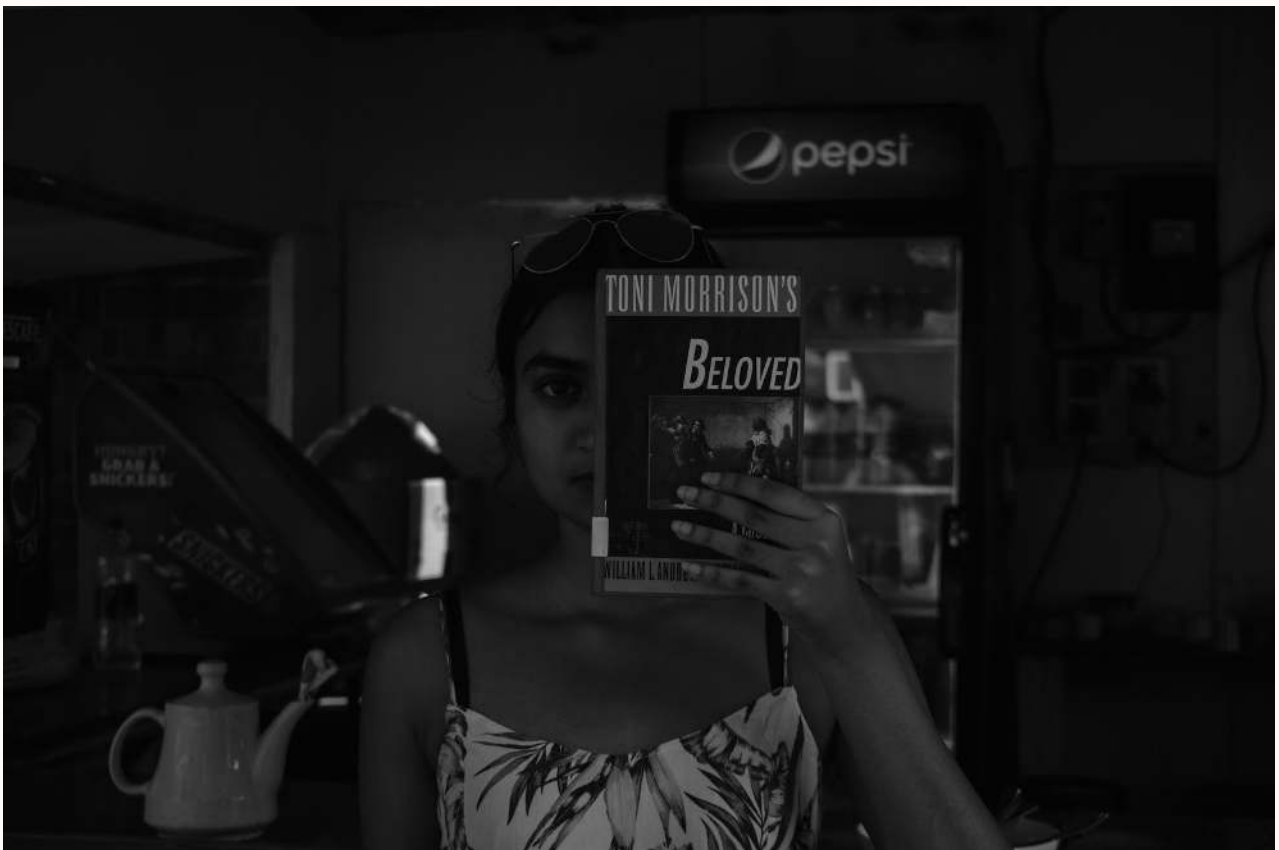
2.1 The shift in the position of BeLoved represents a shift in the understanding of self-care, moving away from its narrow individualistic conception toward normalising the idea of asking for help.