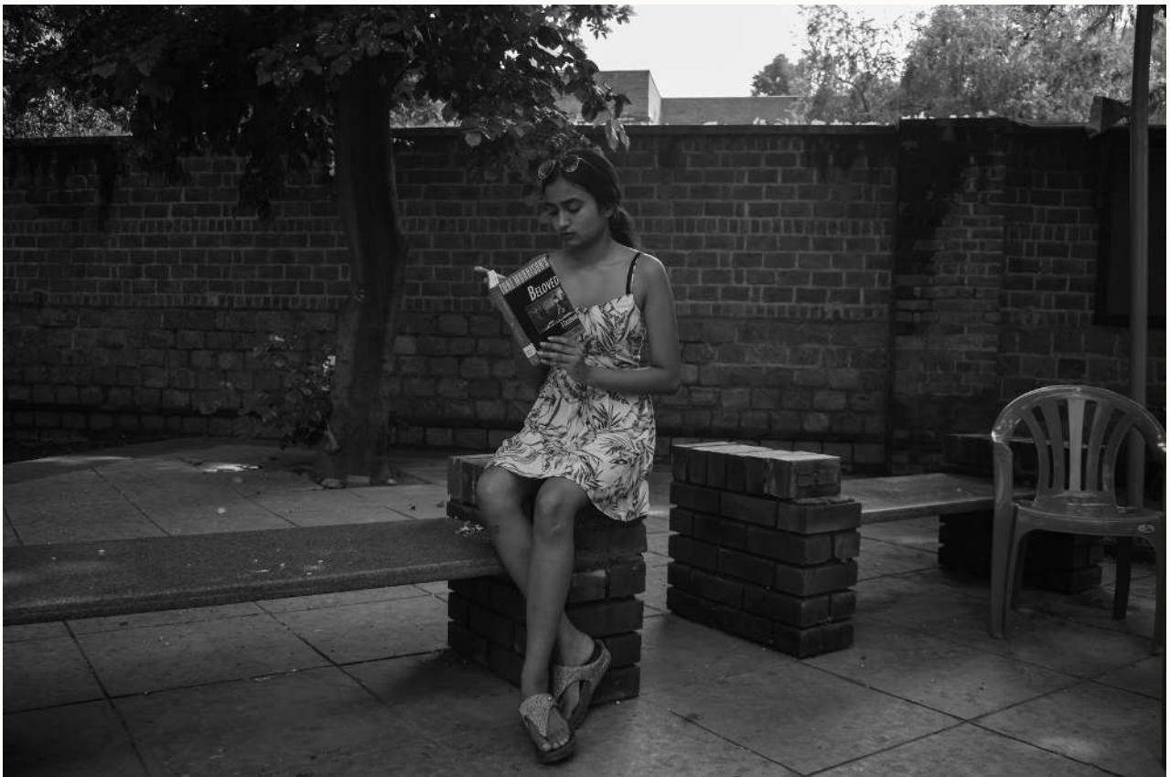
1.3 Understanding self-care in one of its manifestation as an act of learning and assertion of the self.