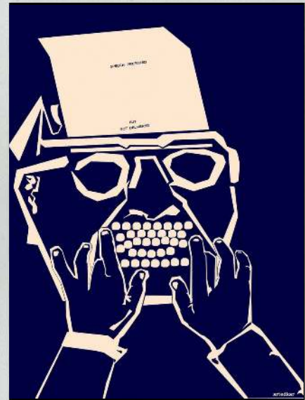
artwork by Artedkar

You use the colour blue in your artwork, which is symbolic of dalit resistance and the Ambedkarite movement. What led you to make this choice?