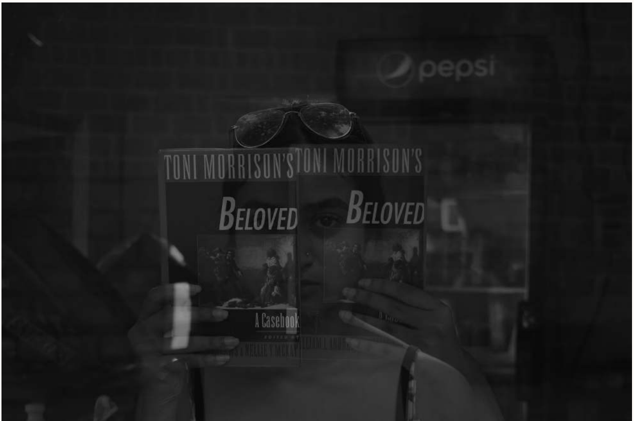
3.1 Juxtaposing the aforementioned two ways in which one stands in relation to the idea of self-care, simultaneously widening the ambit of self-care to speak of the personal as not so removed from the political.