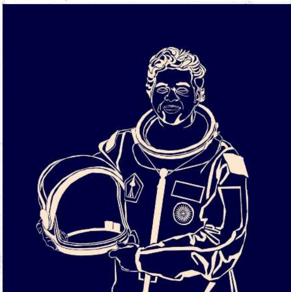
artwork by Artedkar

I try to create my artworks almost entirely on the basis of Ambedkarite and anti-caste iconography. The resources to draw from are simultaneously very rich (in that anti-caste iconography and image-making has been persistently employed throughout the history of South Asia, across centuries if not millenia) and very sparse (in that there has hardly ever been an ideal synthesis of this unique strain of image-making with the tradition of what we commonsensically assume as "classical Indian Art"). The lack of a broader, mainstream visual language vis-a-vis anti-caste image-making means that I cannot wholly dedicate my craft to what I would ideally like to work with: abstraction and minimalism. I am thus invested in gradually producing sparse, minimal, and yet, figurative and agitprop-ish artworks. Hopefully, there will be a "mainstreamization" of visual language in the anti-caste vein in the near future, and I could then go on to dedicate my creative process entirely to my more innately experimental tendencies.