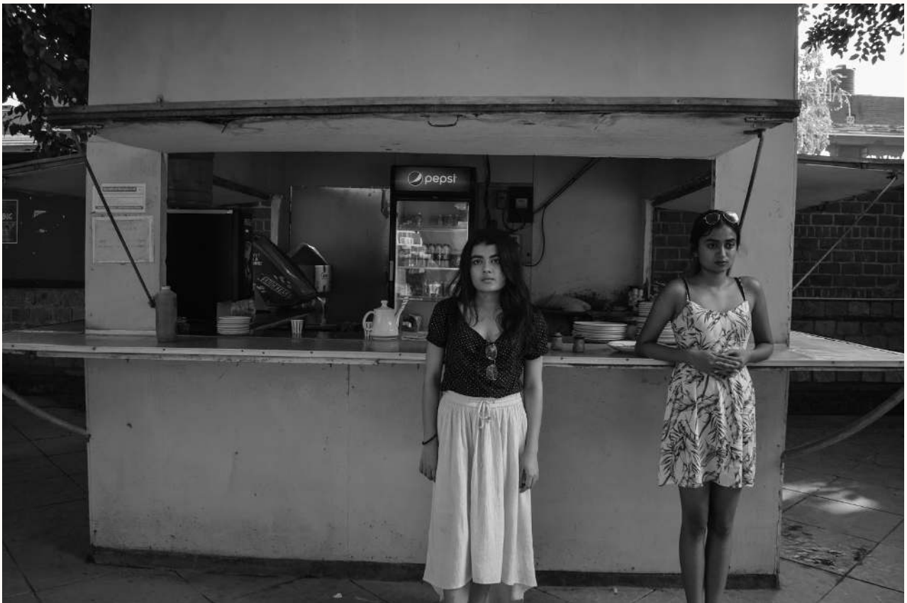
2.2 Bodies existing side by side, creating the possibility of asking for a shoulder to lean on.