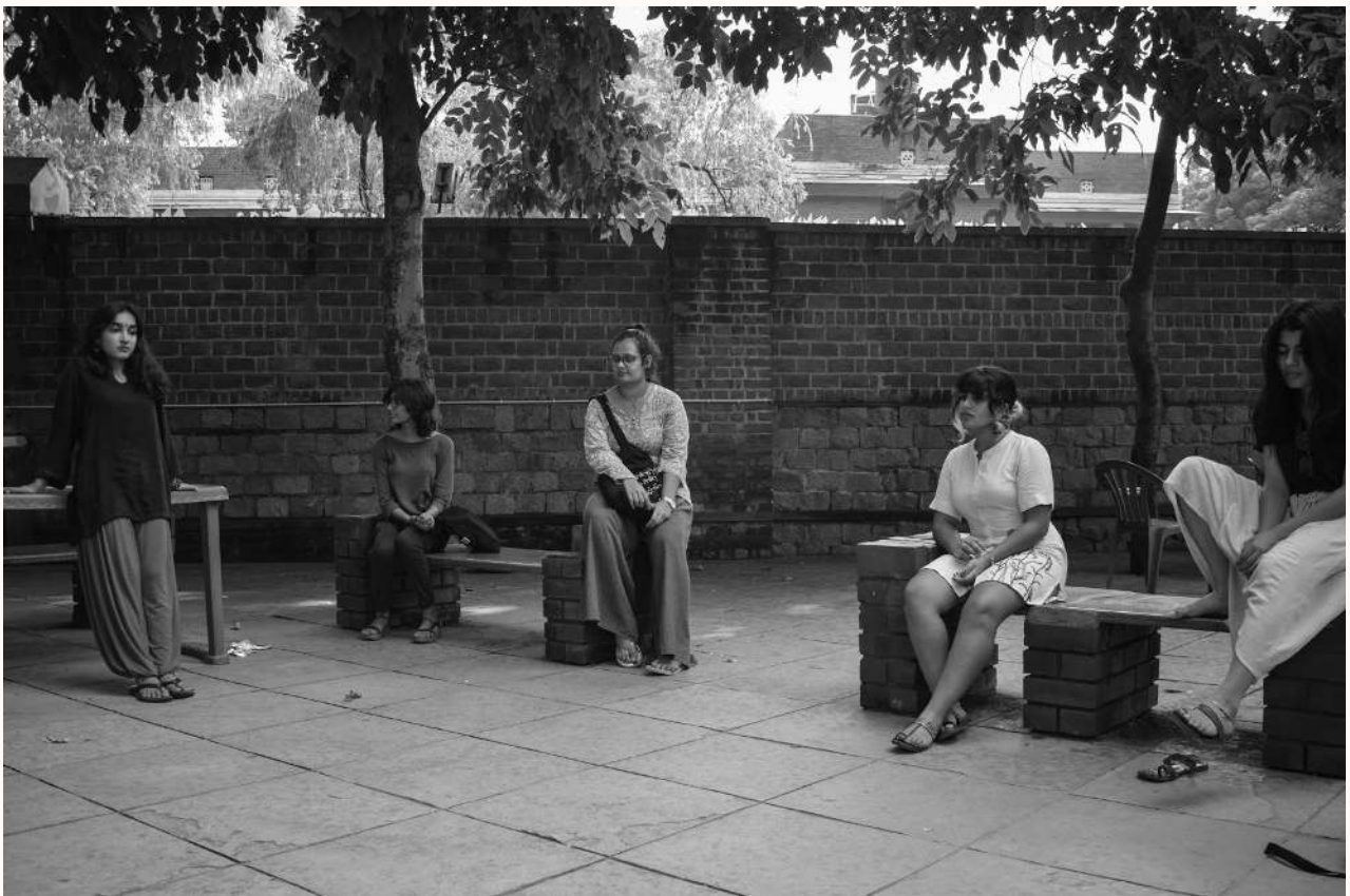
3.2 Individuals existing together but located in a scattered manner in the same space.