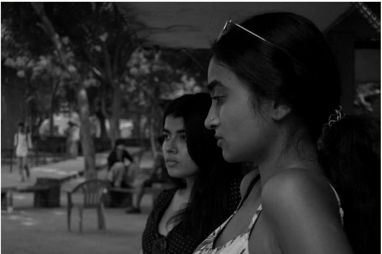
2.3 Bodies almost in contact; appear to be much closer than before, bridging the previously perceived distance when perceived from a different standpoint.