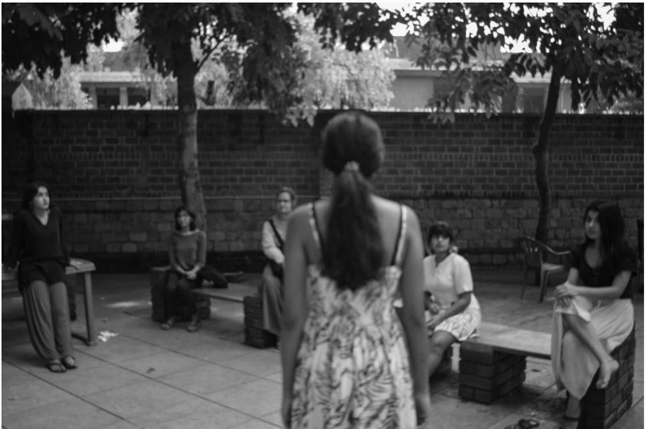
3.3 Navigating through/ stepping into unfamiliar spaces and groups of individuals; moving towards an understanding of the self and its concerns as a socio-political question.