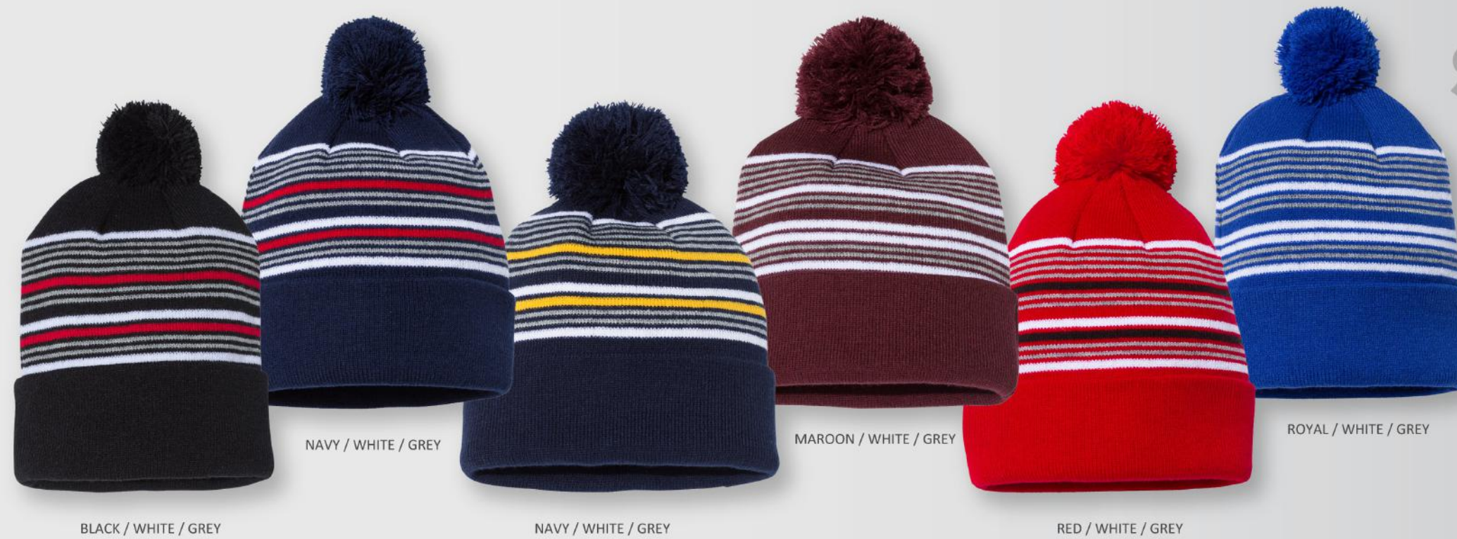
BLACK / WHITE / GREY