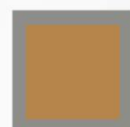
CARHARTT BROWN PMS 463C