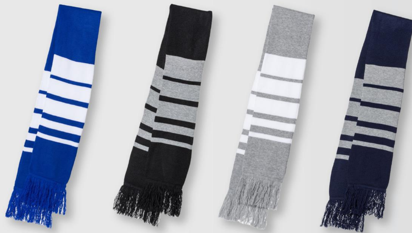
ROYAL / WHITE