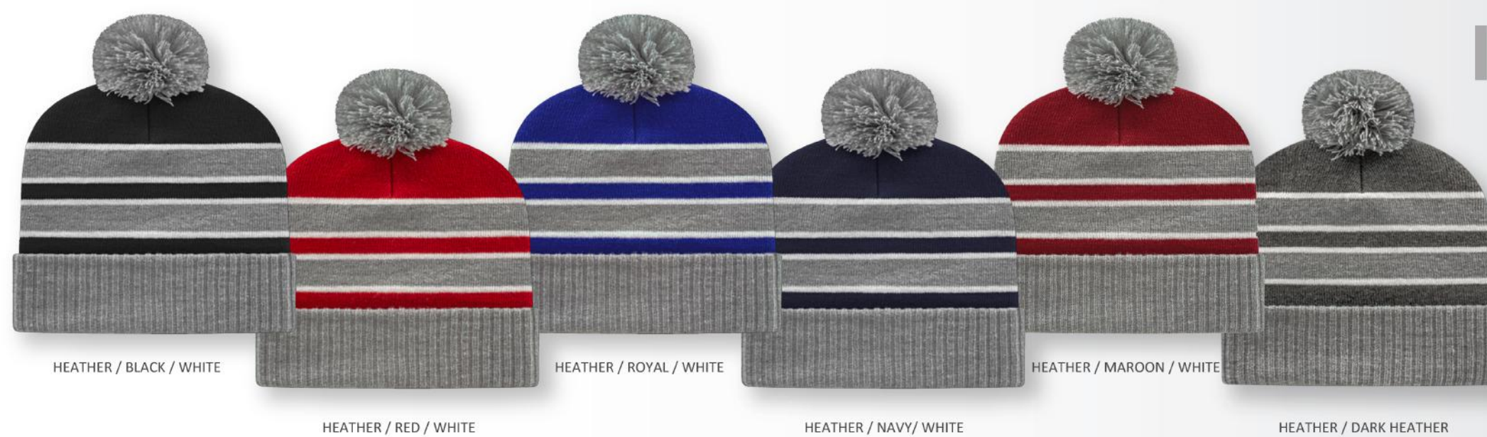
HEATHER / BLACK / WHITE