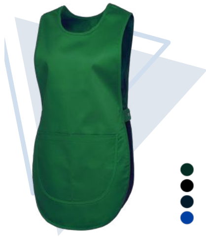
UC920 Heavyweight Tabard

65% Polyester, 35% Cotton 245GSM Self-coloured binding S-2XL Adjustable side straps Black, Bottle Green, Navy, Royal Front pocket with 2 compartments