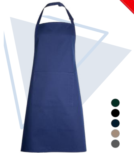
UC940 Arriving in Mid 2024 Bib Apron With Pocket

65% Polyester, 35% Cotton 245GSM Self-coloured binding S-2XL Adjustable side straps Black, Bottle Green, Navy, Royal Front pocket with 2 compartments