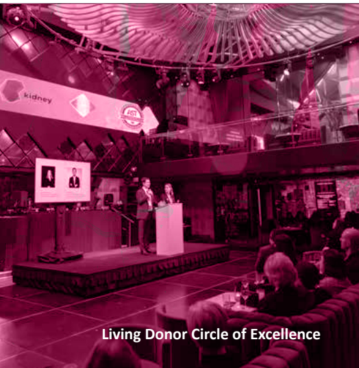
Living Donor Circle of Excellence