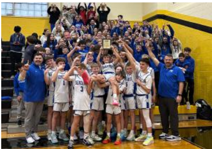
The 7th grade boys basketball team celebrated an undefeated season after claiming the NLL title with a victory over Perrysburg on February 10.