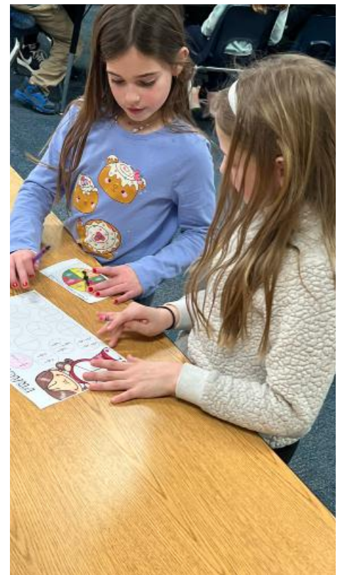
Having fun with fractions at Monclova Primary School.