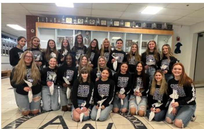
The AWHs cheer squad earned a spot to compete at the OASSA State Tournament in Columbus. The team finished third in the state.