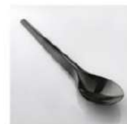
Spoon Bag Ref. No. P-09 Contents: 50 spoons