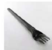
Fork Bag Ref. No. P-10 Contents: 30 forks