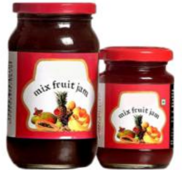
Mix Fruit Jam