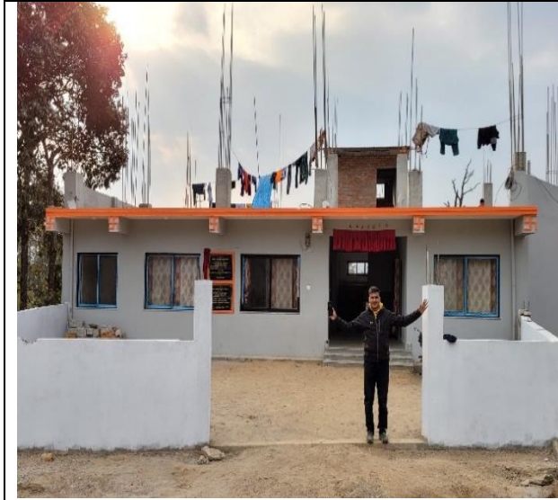
View of chhatravas from road side

The chhatravas building constructed under this project has a total of three floors. Since, it is a hilly area and the ground in such areas is not flat, only the upper floor is visible from the main road, and the remaining two floors are below the road surface.