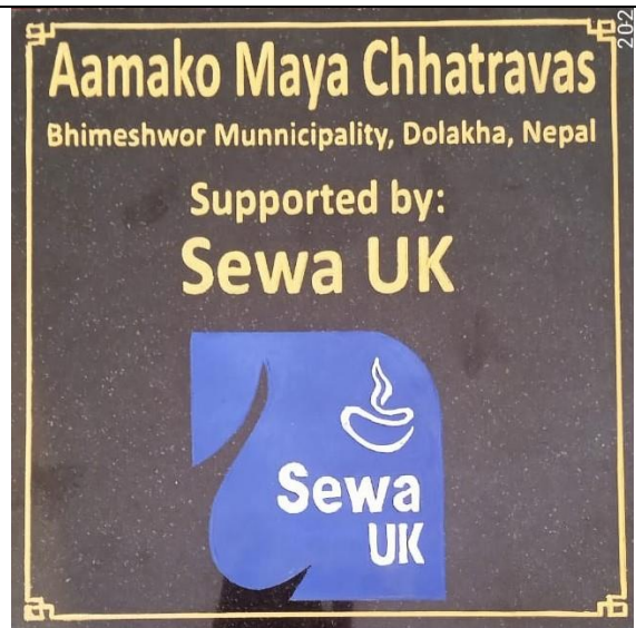
Inscriptions regarding support of Sewa UK