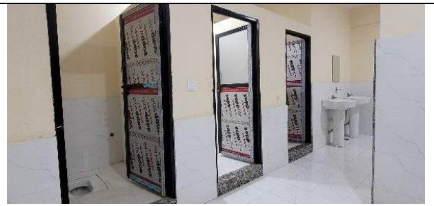
Communal Toilets and Showers