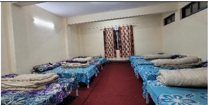
Dormitory of Students in the Chhatravas