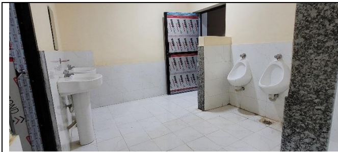
Communal Toilets and Showers