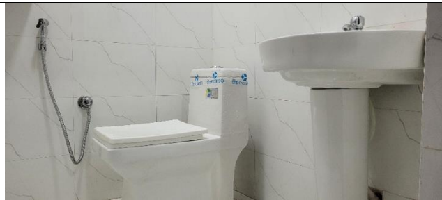
Attached Wash Room in Guest Room