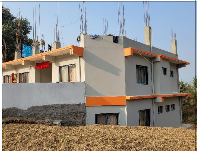
North-East Look of Chhatravas