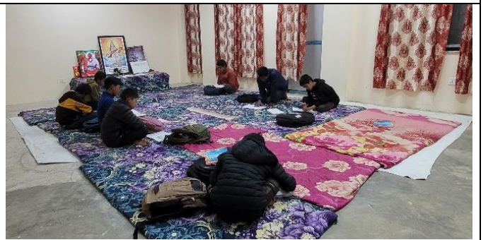
Common Study Hall