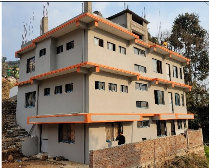
West-North View of the Chhatravas