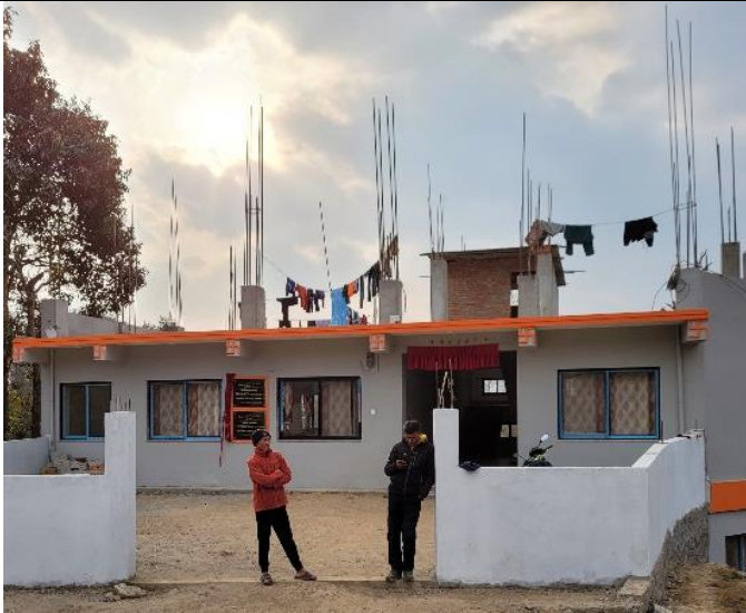
Front side (east) View of the Chhatravas