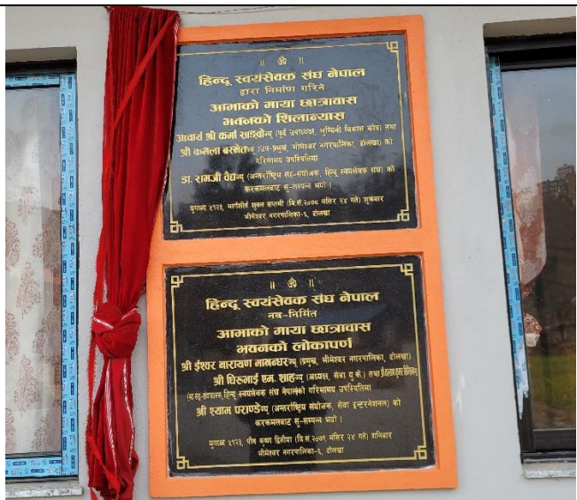
Inscriptions of Foundation Stone and Inauguration