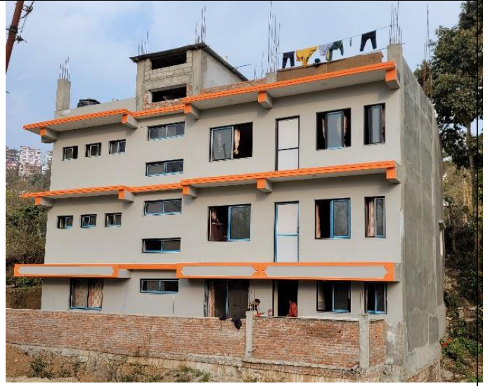
South-West View of the Chhatravas