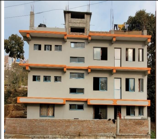
View of chhatravas from back side

The newly constructed chhatravas building has the following structures: