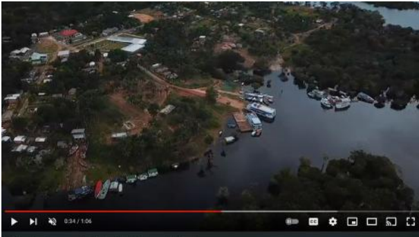
A TRIP TO THE AMAZON WITH RHCC