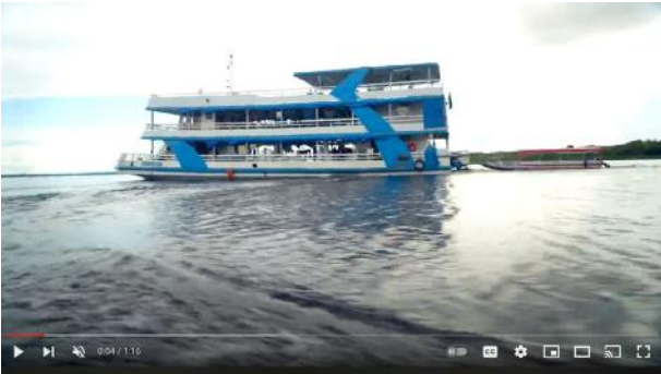
SPLENDOR BOAT TOUR