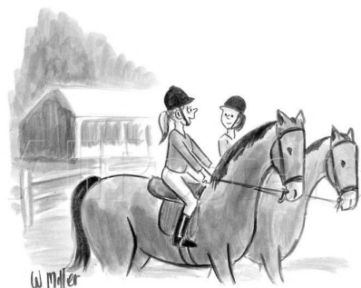
"I just know I'm going to love horses all my life. That's why I'm planning to have a career in banking, insurance, and real estate."