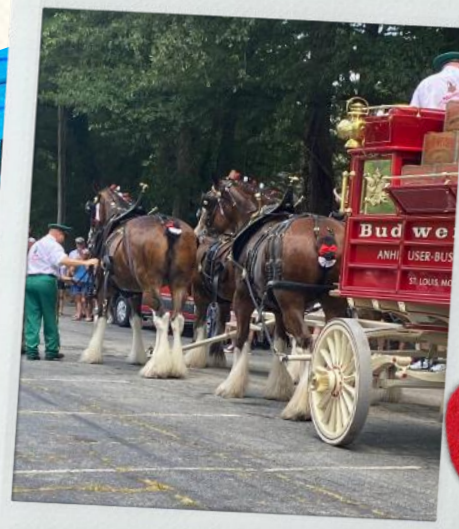
Be gentle with yourself