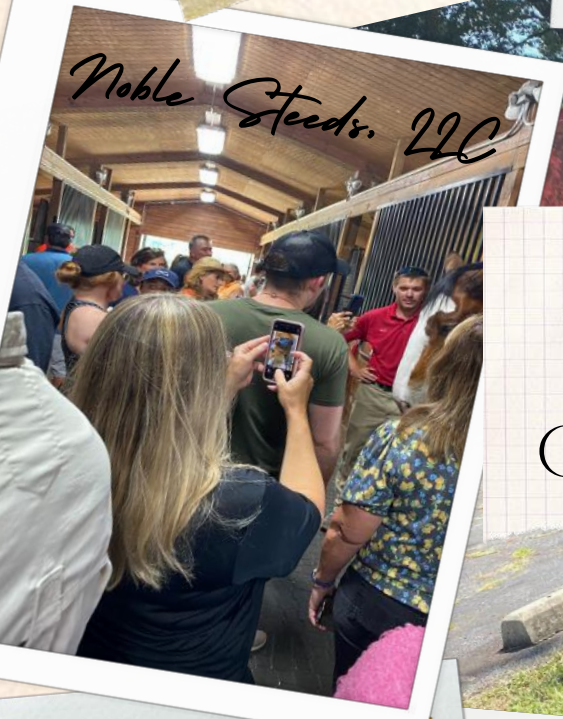
Noble Steeds 22C