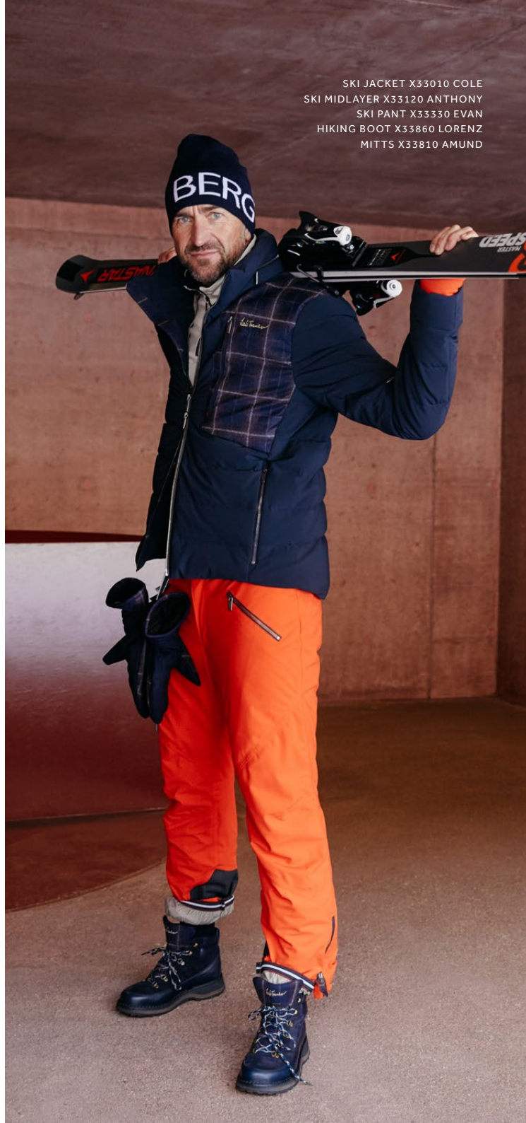
SKI JACKET X33010 COLE SKI MIDLAYER X33120 ANTHONY SKI PANT X33330 EVAN HIKING BOOT X33860 LORENZ MITTS X33810 AMUND