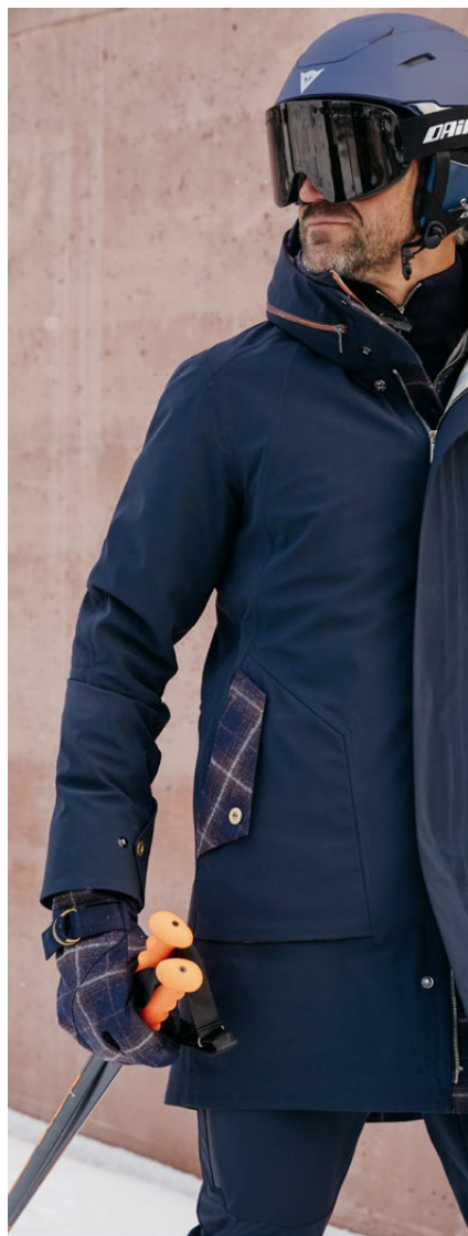
SKI PARKA X33000 XANDER SKI MIDLAYER X33100 GRAYSON SKI PANT X33310 HUNTER MITTS X33810 AMUND