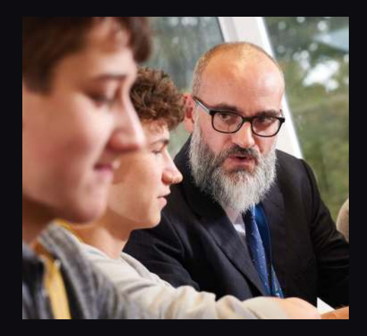
"ADVICE AND GUIDANCE GIVEN TO STUDENTS HELP TO Make sure their personal AIMS are met." - Ofsted