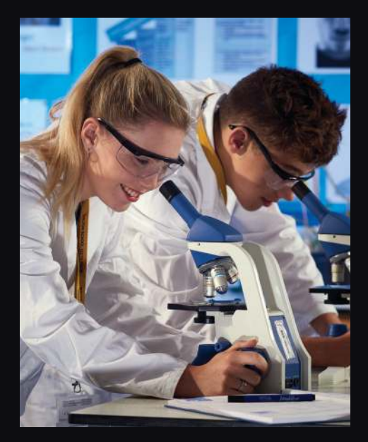
"STAFF ' Go the extra mile " To help students." - Student survey