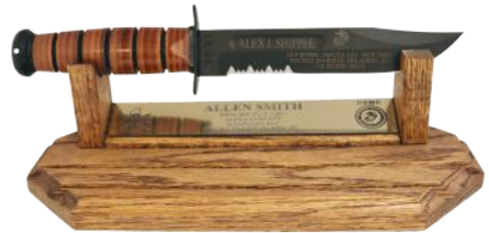
KA Bar with Stand