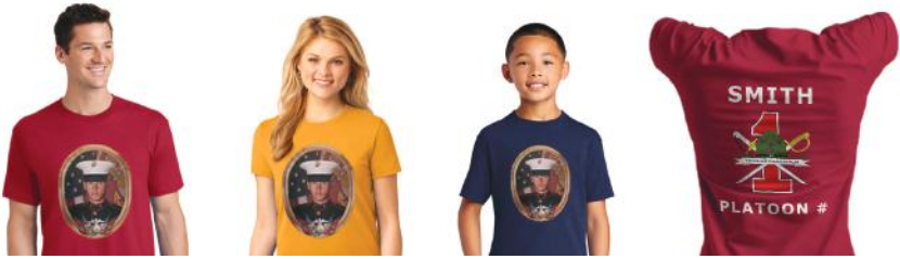
Adult & Youth Proud Family Shirts