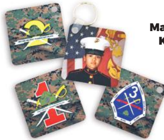
Marine Photo Keychains