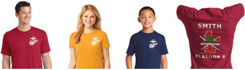
Adult & Youth Eagle, Globe & Anchor Shirts