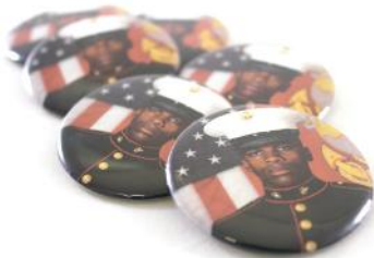
Photo Buttons - Set of 6