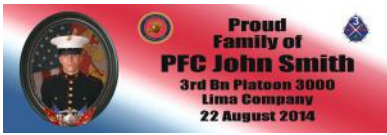
Proud Family Banner