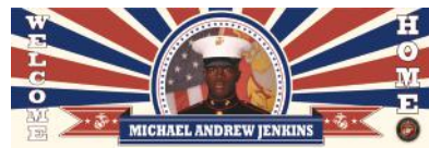
Welcome Home Banner