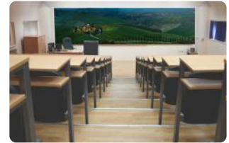
Auditorium & Lecture Hall