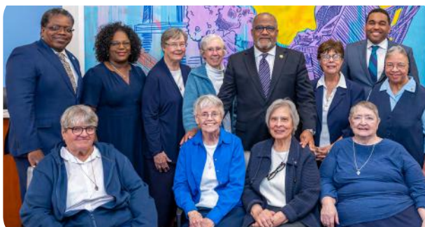
Cover photo: BMIKE Artwork/Sisters at Unveiling