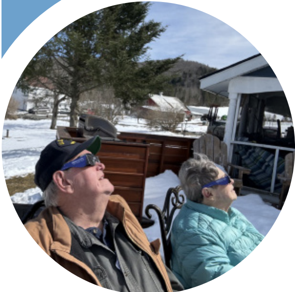
Did you catch the April 8 eclipse?