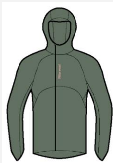
N2CWRJ1-001 Womens Trail Rain Jacket Black CHF 269.00