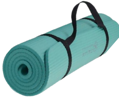
FOAM YOGA MAT