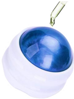
ROLLER BALL MASSAGER