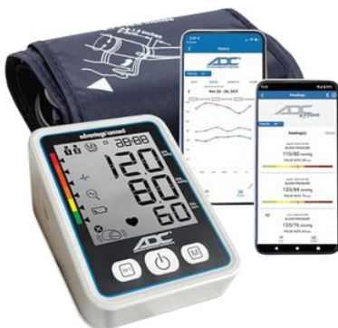
AUTOMATIC BLOOD PRESSURE CUFF