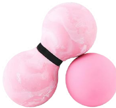
SPORTS MASSAGE BALLS