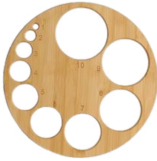
CERVICAL DILATION WHEEL