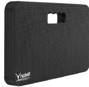
FOAM KNEELING PAD