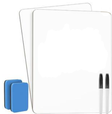
2-PACK DRY ERASE BOARD