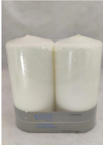
CL5828-003 3 X6"