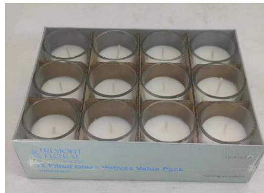
CL5819-003 2.1" HT OF GLASS