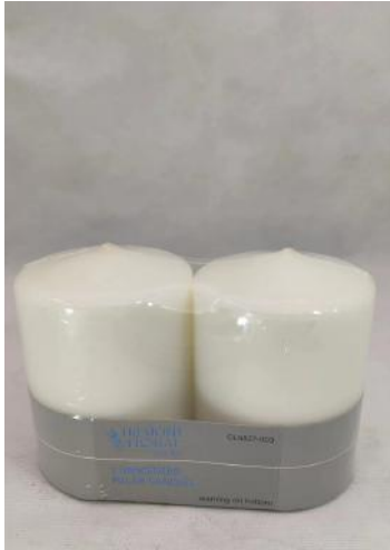
CL5827-003 3 X4"

unscented 2 packs - paraffin wax - cotton wick