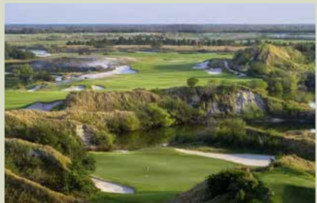
STEAMSONG RESORT Bowling Green, Florida