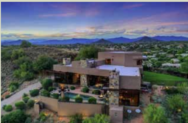
SAGUARO POINT Scottsdale, Arizona

Wanna Get Away!? There's nothing better than breaking up the off-season monotony then getting a few friends together and heading to a golf destination. It's a wonderful time experiencing a new destination and getting to know your fellow members and golf professionals. Details are currently being finalized for a February or March Trip.