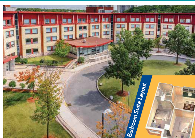
Two Bedroom Suite Layout