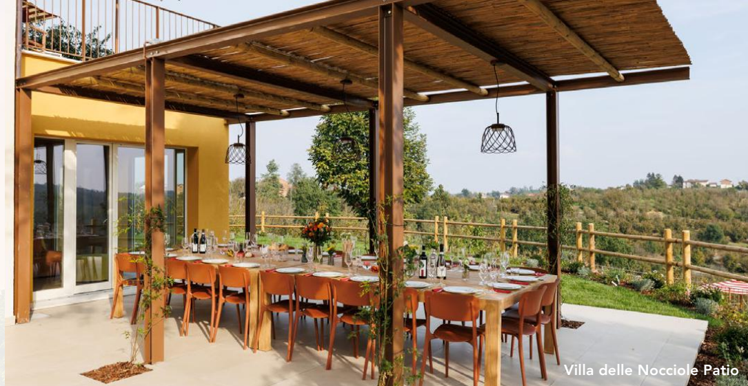
Villa delle Nocchie Patio