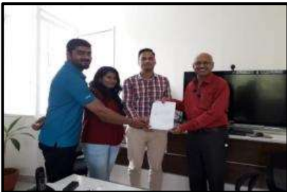
Infosys visit on 14th September 2019