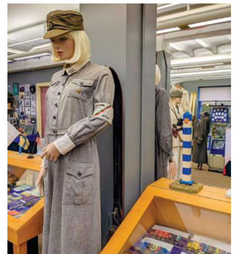
Lotta uniform on display at Price of Freedom Museum