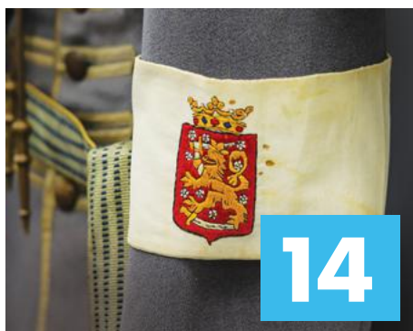
The Price of Freedom: North America's Largest Collection of Finnish War Memorabilia Donated to FAHC