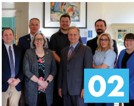
Leadership: Finlandia University Management Team