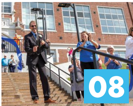
Collaboration Makes Us Stronger