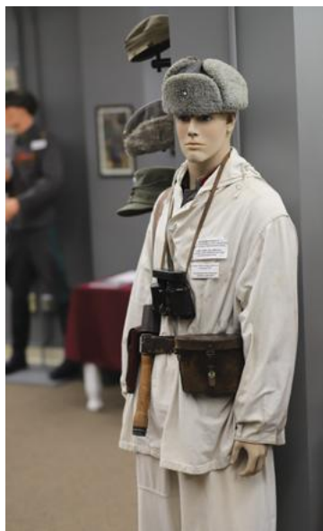
Finnish soldier during Winter War in Finland 1939