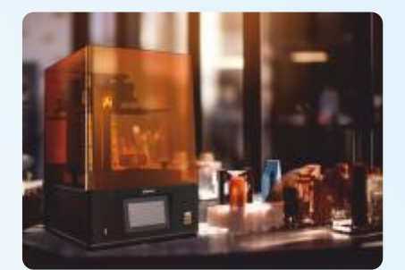
10" LCD for Bigger Possibilitie