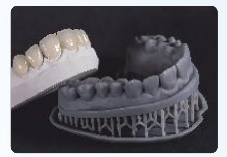
Reliable 12K Printing Quality