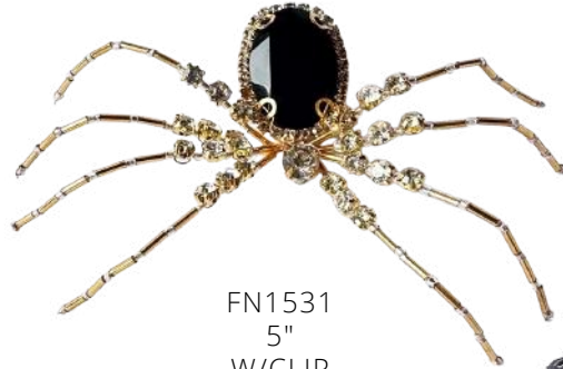
FN1531 5" W/CLIP