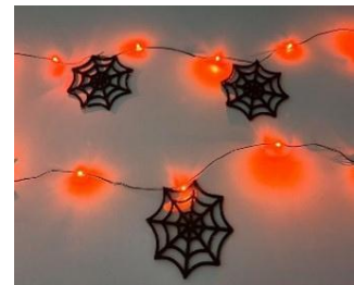
LU-67323 15 LIGHTS