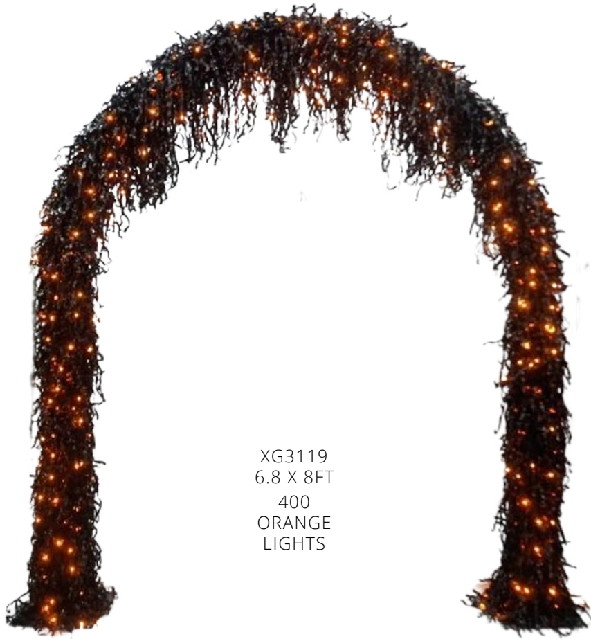
XG3119 6.8 X 8FT 400 ORANGE LIGHTS