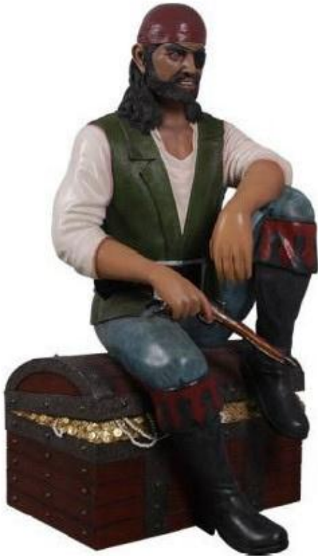
N4281 58" H SITTING PIRATE