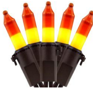
LU-67311 50 LIGHTS