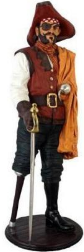
N4280 76" H CAPTAIN WOODEN LEG