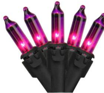
LU-67307 100 LIGHTS