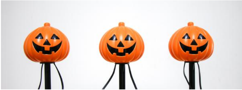
LU-67303 SET OF 5 LIGHTS