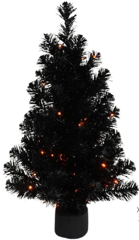
XT061007 24" W/50 ORANGE LIGHTS