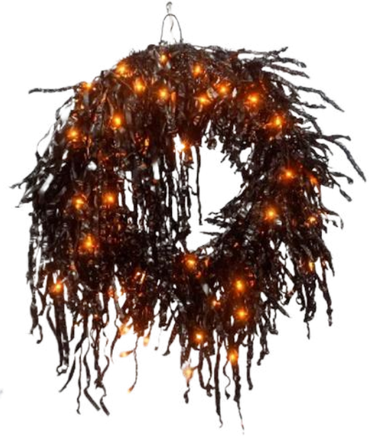
XW3120 26" 50 ORANGE LIGHTS