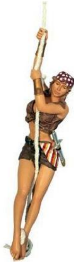
N4276 79" H SEXY GIRL PIRATE