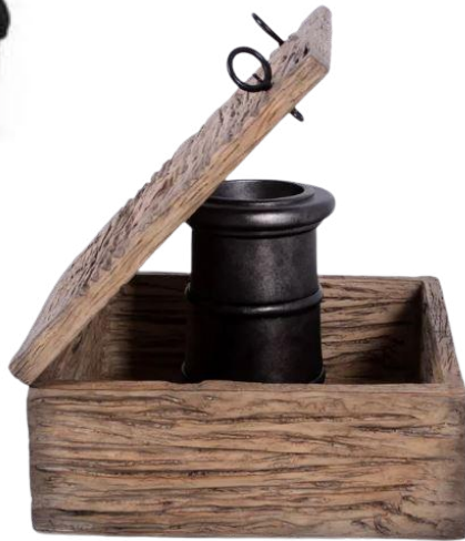
N4283 23" H CANNON WALL DECOR