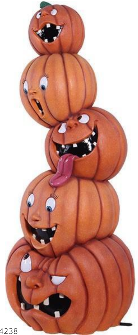
FN4238 6 FT