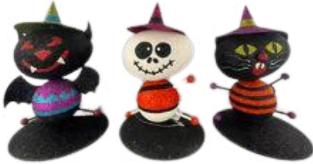
FN6042 6" SET OF 3