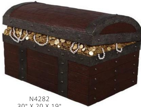
N4282 30" X 20 X 19" PIRATES WAR CHEST