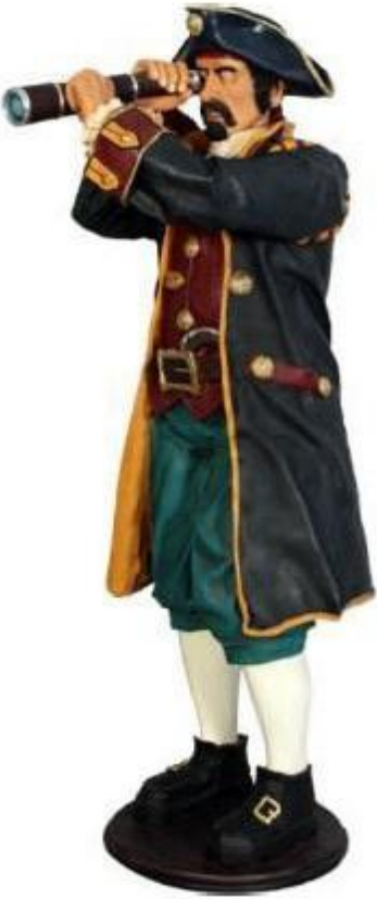
N4278 73" H CAPTAIN PARUCHE