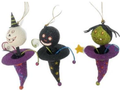
FN6040 4.5" SET OF 3