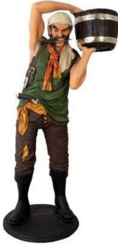
N4279 76" H PIRATE W/ BUCKET