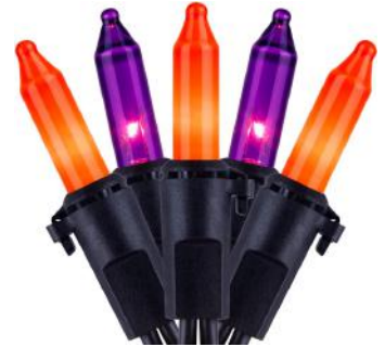
LU-67308 100 LIGHTS