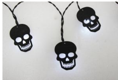
LU-67324 10 LIGHTS