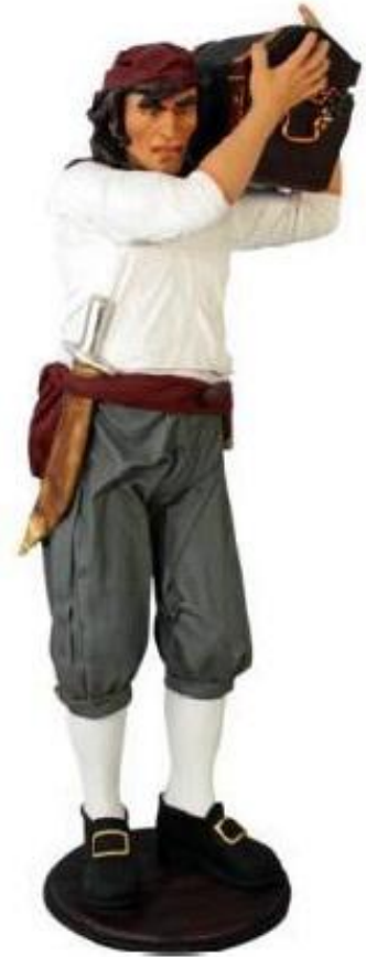
N4277 78" H TREASURE HUNTER