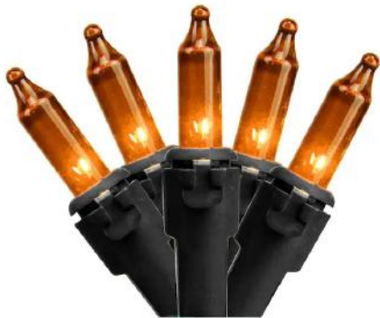
LU-67306 100 LIGHTS