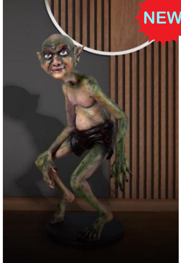
N42109 34" HT