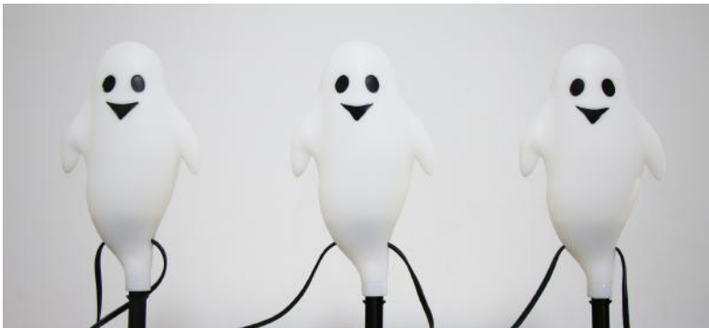
LU-67305 SET OF 5 LIGHTS