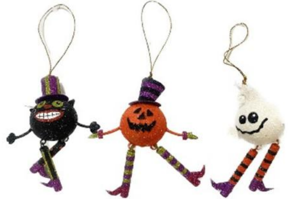
FN6039 5" SET OF 3