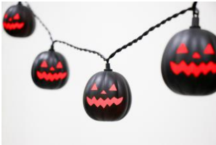
LU-67309 10 LIGHTS