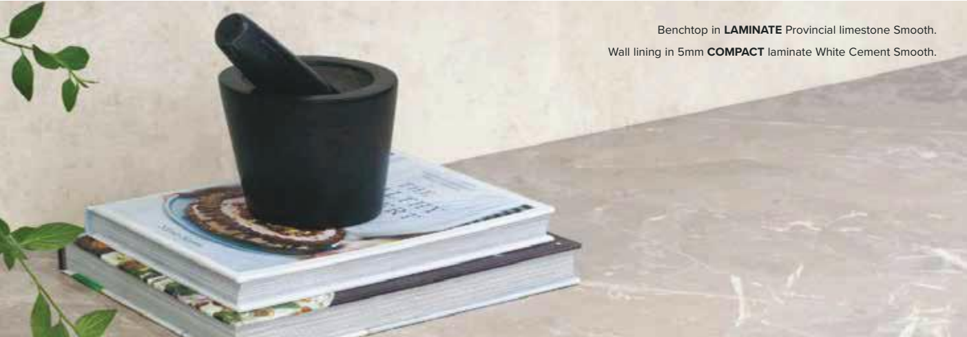
Available finishes M = Matt T = Texture

polytec swatches and samples represent a small area of the overall colour structure. To view the large colour sample, visit www.polytec.com.au . Dark coloured surfaces will show fingerprints and require more care and maintenance than lighter coloured surfaces. It is recommended to test a product sample prior to colour selection.