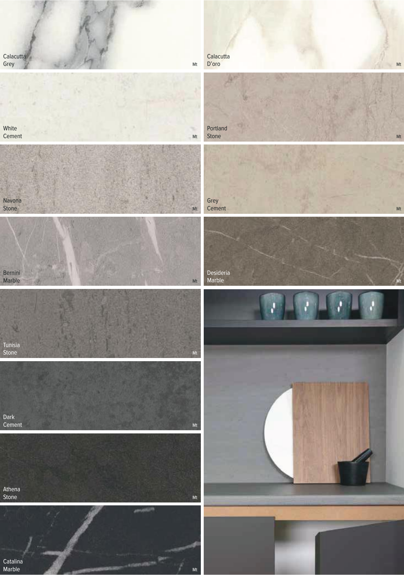
Available finishes Mt = Matra

polytec swatches and samples represent a small area of the overall colour structure. To view the large colour sample, visit www.polytec.com.au . Dark coloured surfaces will show fingerprints and require more care and maintenance than lighter coloured surfaces. It is recommended to test a product sample prior to colour selection.