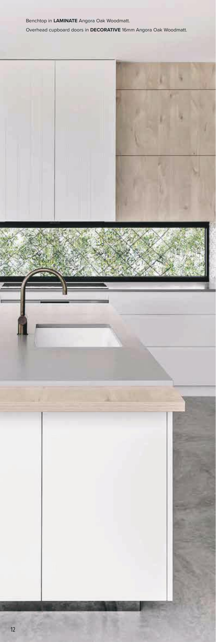
Benchtop in LAMINATE Angora Oak Woodmatt. Overhead cupboard doors in DECORATIVE 16mm Angora Oak Woodmatt.