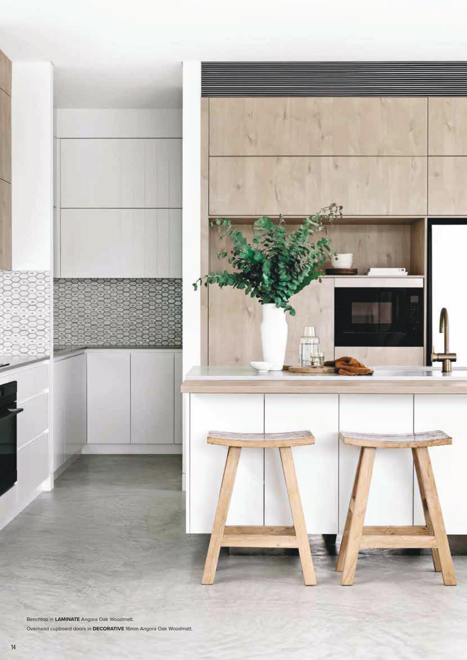
Benchtop in LAMINATE Angora Oak Woodmatt. Overhead cupboard doors in DECORATIVE 16mm Angora Oak Woodmatt.