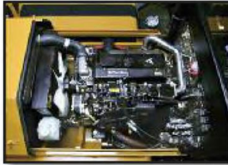
ENGINE: The M Series forklifts have a sliding hood for easy access during maintenance, and house a Perkins Turbo Tier 3 emissions compliant diesel engine.