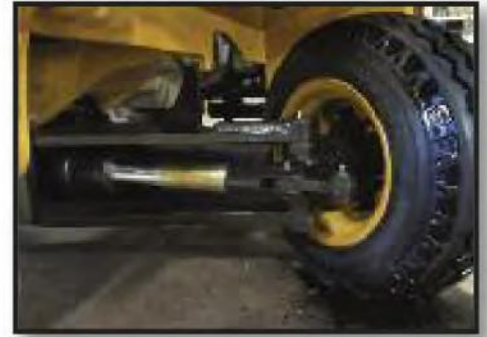
STEERING CONTROL: Designed for durability with an extreme duty sandwich type axle. Single cylinder with 4 inch diameter rod, and heavy duty spindles.