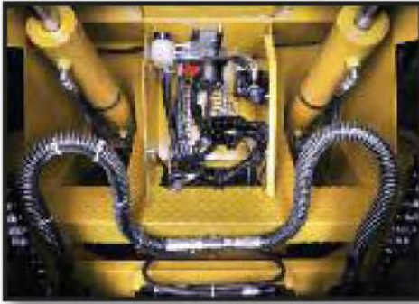
ELECTRICAL PANEL: Electrical system maintenance is easy through a hinged weather tight compartment located on the front of the unit between the forks.