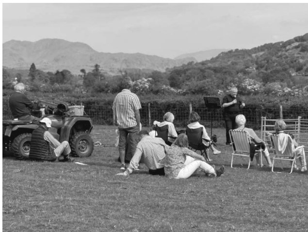
Lambing Service at Great Knott Far, Blawith