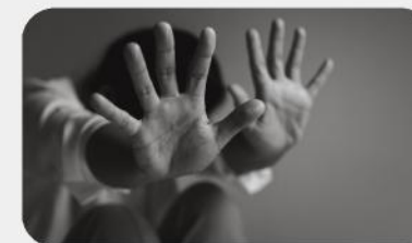
Breaking the Silence (.e.g., Tackling Abuse)

The topics mentioned above are a representation only, visit our member hub to view dates, times and content of the forums