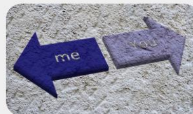
Separation & Divorce