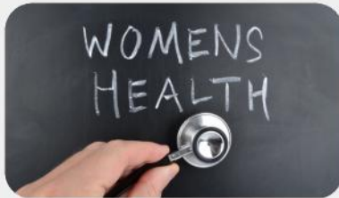
Women's Health (e.g. Menopause)