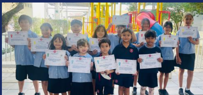
STAR OF THE WEEK 9TH JANUARY 2025

Chinese New Year Celebrations 9.00am in the Lily Theatre