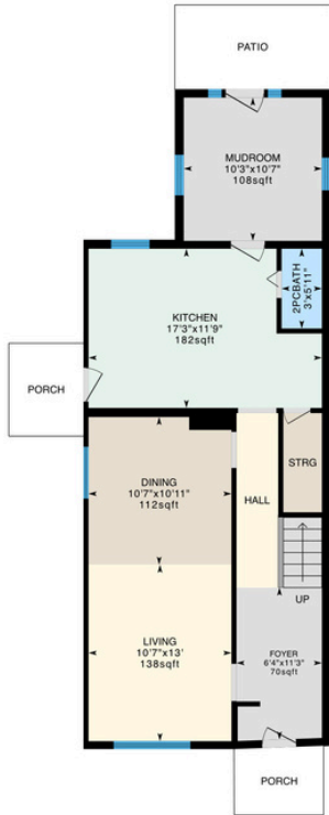
Main Floor Exterior Area 827.55 sqft

Main Building: Total Exterior Area Above Grade 1533.67 sqft