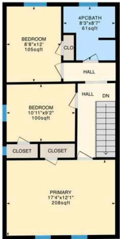
2nd Floor Exterior Area 706.12 sqft