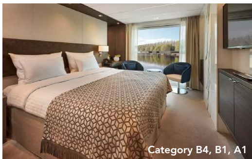
Category B4, B1, A1

Individual climate control, walk-out exterior balcony, choice of bed configuration (double or twin bed), walk-in wardrobe, comfortable corner sofa, flat screen television, mini-bar, direct dial telephone, safe, and luxurious en suite bathroom with shower, bathrobes, and hair dryer. 284 sq. ft.