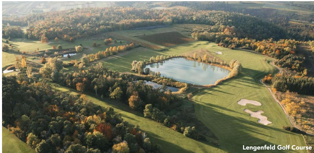
Lengenfeld Golf Course