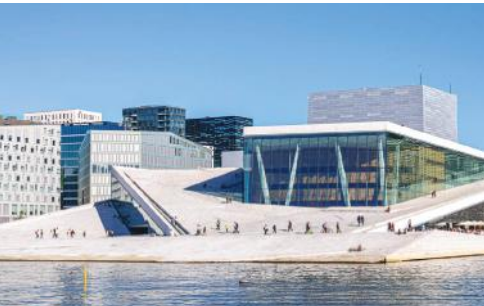
Oslo Opera House

After breakfast, travel by train to the town of Myrdal then board the scenic Flåm Railway which takes you on a spectacular journey to Flåm. From there, take an awe-inspiring express boat trip along the Sognefjord, Norway's longest and deepest fjord, and into Bergen.