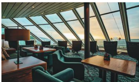
Explorer Lounge & Panorama Bar