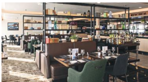
Torget Main Restaurant