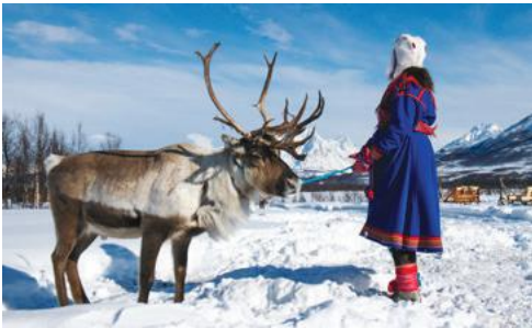
Sami people in Lapland