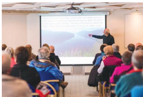
Coastal Experience Team