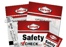
Vehicle Information Package (Standard)