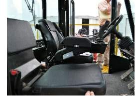
Fully Adjustable Air Ride Seat (Available Trainer Seat)