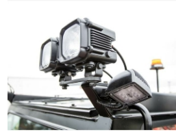
10 LED Work/Step Lights (Standard)